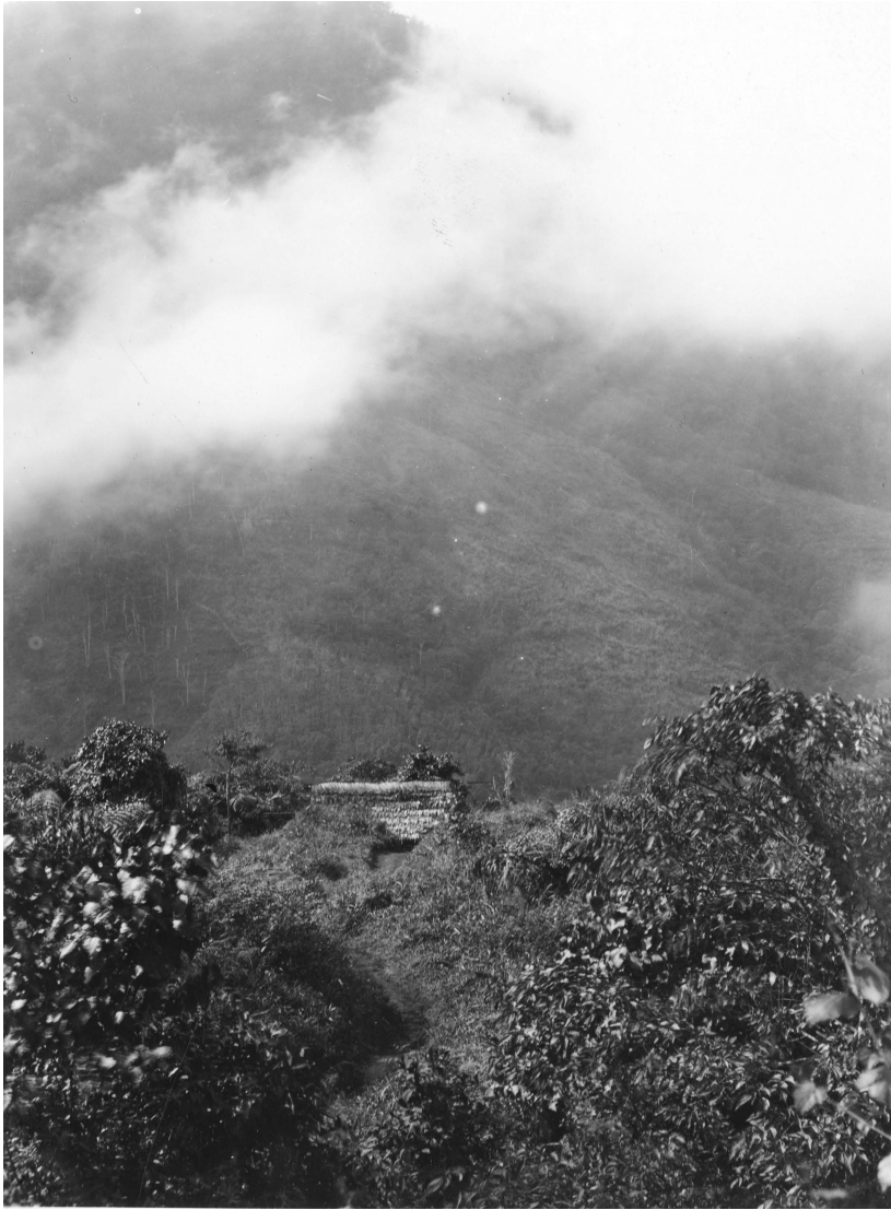
FIGURE 11. View of the surroundings at Sevia.