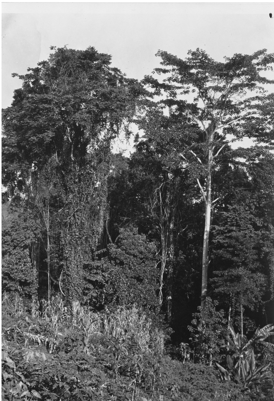
FIGURE 6. Edge of forest at Keku.