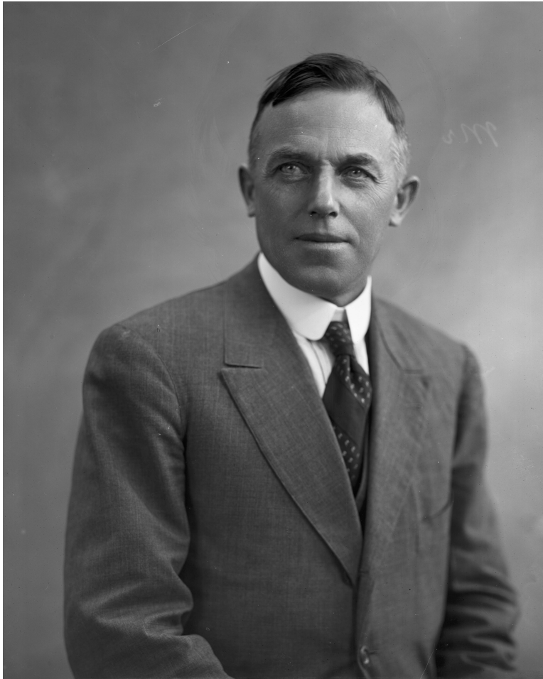
FIGURE 1. Rollo Howard Beck (1870–1950). Photograph made in 1917, at the end of the AMNH Brewster – Sanford Expedition (AMNH neg. no. 36747).

Guinea Birds (Mayr, 1941), Mayr was misled in some cases by these ambiguities in the localities of Beck's specimens.