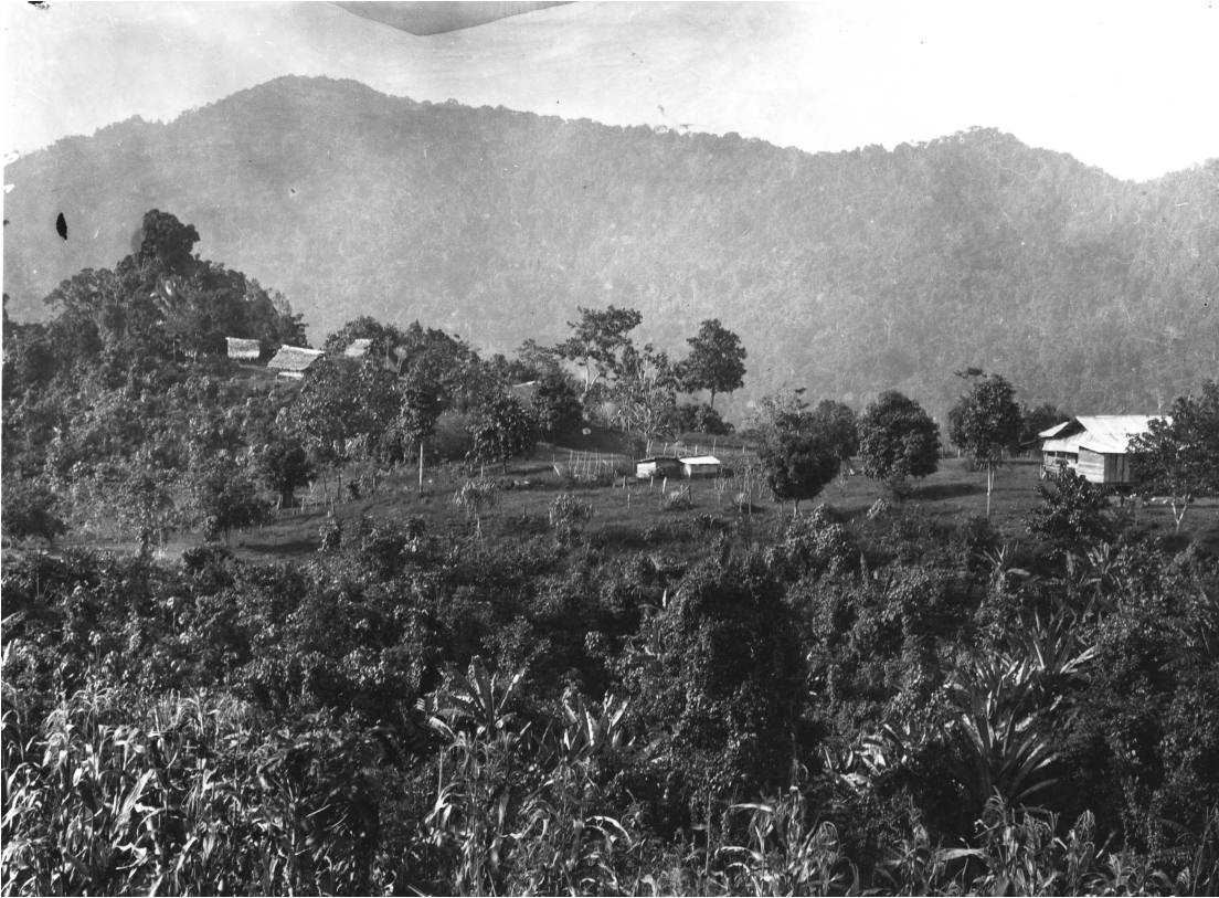
FIGURE 5. View of the mission at Keku.