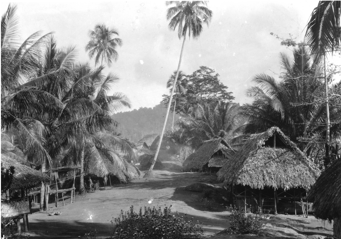
FIGURE 3. "Main Street" in Meganum (AMNH negative no. 115630).

Despite the difficulties of collecting, Beck noted having collected about 320 birds in his six weeks at Meganum. This would have included specimens that Manube (fig. 4), his hired local collector, brought to him from 10 miles farther inland. As Beck described it, Manube left on one day, spent the next day collecting, and returned on the third day. The birds brought in by Manube probably were collected in the Adelbert Mountains, an area the missions considered extremely dangerous at that time but that would have been freely accessible to local people. Manube continued to send Beck birds until 14 September, when Manube accompanied Ida to Madang. Beck continued collecting at Meganum for some time after that, at least until 4 October, and other local men continued to bring Beck specimens on instructions from Manube, who quite possibly had also returned to Meganum from Madang.