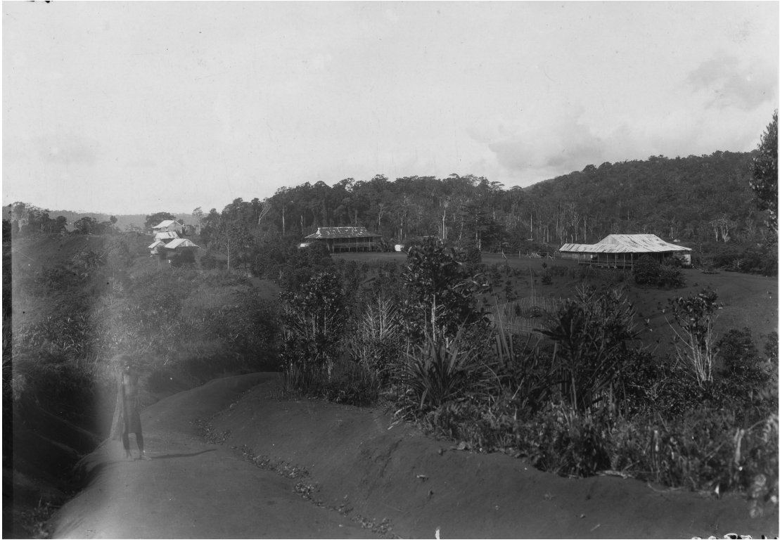
FIGURE 8. View of the surroundings at Wareo (AMNH negative no. 115801).

zigzagged up the sides of ridges to tracks across the narrow tops, with spectacular views of gardens on the steep hillsides. They arrived at Sevia, about 5000 ft, at 1 pm, just in time for the almost daily bank of fog to arrive (fig. 11). On one sunny afternoon, Beck followed a local trail to an elevation of 7500 ft. The summit of this ridge apparently marked the height of land in this part of the Cromwells, for the trail led downward to a village on the other side of the mountains. From these higher altitudes on sunny days the mountains of New Britain could be seen to the east.