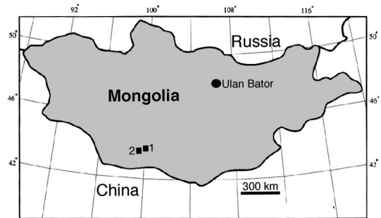
Fig. 1. Map showing the Mongolian Late Cretaceous localities of Gurilyn Tsav (1), where PIN 4499-1 was found, and Bugeen Tsav (2). Both have been dated Campanian to Early Maastrichtian in age (see text for details).

STRATIGRAPHIC AND GEOGRAPHIC DISTRIBUTION: Members of Presbyornithidae are known from the Upper Cretaceous of Mon-