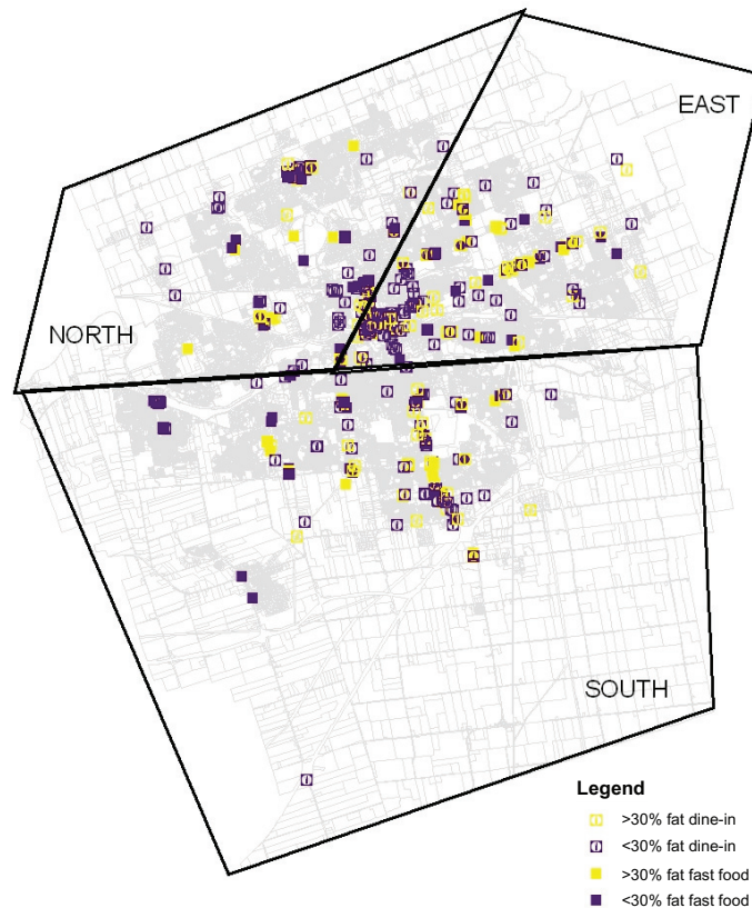
Figure 3. Geographic distribution of eating opportunities.

Eating opportunities averaged 1.49 \pm 1.10 km to the closest fast food or dine-in restaurant. The mean distance to the closest fast food outlet was 1.35 \pm 0.85 km (range 0.16 km to 5.43 km). The mean drive time to the closest fast food outlet was 2.70 \pm 1.35 minutes (range 0 to 9 min). Average distance to the closest dine-in restaurant was 1.63 \pm 1.35 km (range 0.08 km to 6.63 km). Average drive time to the closest dine-in restaurant was 2.88 \pm 1.95 min and, similar to the drive time to the closest fast food outlets (range 0 to 9 min).