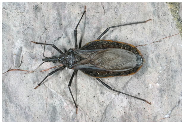
Figure 4. Female Triatoma recurva , the largest kissing bug in the United States.

Kissing bugs are also able to sing , although the purpose of stridulating or sound production is unknown. 19 The long proboscis of kissing bugs terminates at the rostrum, and when the bug is not feeding, it is folded under the prosternum and lays in a recess or stridulitrum. This elegant structure has chitinous, transverse grooves or sulci that form a sort of washboard . Rubbing the rostrum on the stridulitrum gives rise to sound, a barely audible chirping.