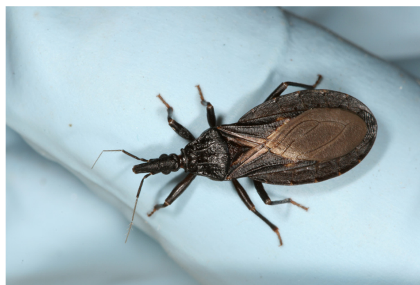
Figure 3. Male Triatoma protracta , another cause of anaphylaxis in California and Arizona.

Aggregation of kissing bugs in hiding refuges appears to be mediated in part by pheromones present in feces 17 and epicuticular hydrocarbons on the bug body. 18 The attraction appears weak and difficult to demonstrate and dependent on the status of individual bugs. Unfed, immature T. infestans were attracted to papers contaminated with feces, whereas recently fed individuals were not attracted. 17 The main attractants in epicuticular lipids are the free fatty acids steric (octadecanoic acid) and, at low concentrations, hexacosanoic acid. At high concentrations, hexacosanoic acid is repellent. 18