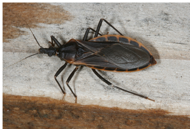
Figure 2. Female Triatoma rubida , a common cause of anaphylaxis in Arizona.

Sexual communication in triatomines remains poorly understood. Sex pheromones are produced in adult metasternal