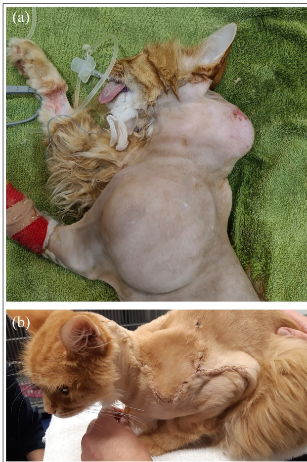
Figure 1 Gross appearance of the cutaneous xanthomas (a) preoperatively and (b) 2 weeks postoperatively

A board-certified internist experienced in ultrasonography performed ultrasounds of the abdomen and masses. The liver and spleen were normal in size, shape and echogenicity. The gallbladder was moderately distended, without distension of the common bile duct, and contained small amounts of gravity-dependent sediment. The kidneys were normal in size (left 4.6 cm and right 3.9 cm in length) and shape. The adrenal glands were normal in size (left 0.45 cm and right 0.42 cm at their respective caudal poles) and shape. The pancreas was mildly thickened (body 12.1 mm and pancreatic duct 2.0 mm in width), consistent with historical or chronic pancreatitis. The gastrointestinal tract was normal in thickness and layering. The jejunal and ileocolic lymph nodes were of normal size but were mildly hypoechoic and prominent. There was no abdominal free fluid. The cranial thoracic mass contained hypoechoic and thickened tissue consistent with cellulitis and oedema. Fine-needle aspiration (FNA) with a 22 G needle was non-productive. The dorsal cervical mass contained echogenic material. FNA yielded 60 ml of blood-tinged