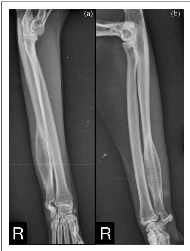
Figure 1 (a) Craniocaudal and (b) mediolateral views of the right antebrachium. A large monostotic lesion is observed on the distal diaphysis of the ulna

thorax was performed. The scan was carried out under general anaesthesia using a four-slice CT scanner (GE LightSpeed; General Electric Healthcare). The patient was positioned in sternal recumbency with the forelimbs extended and parallel to each other. On the CT workstation, images were acquired with soft tissue, pulmonary and bone algorithms, and reformatted in sagittal and dorsal planes. The images were reviewed using a DICOM viewer application (Horos, version 3.3.0; GNU Lesser General Public License) using soft tissue (Window Width [WW]=400, Window Level [WL]=40), pulmonary (WW=1400, WL=-500) and bone windows (WW=1500, WL=300). Adjustments to image window width and level were made as needed.