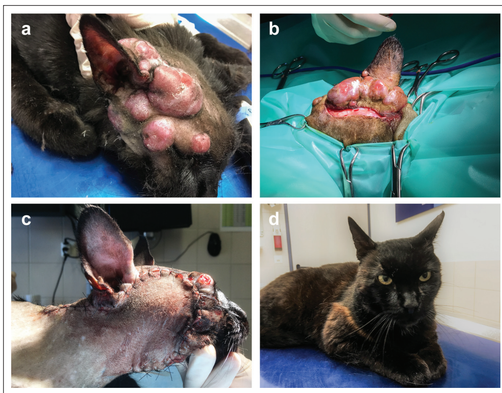
Figure 1 (a) Nodular skin lesions surrounding the base of the right ear and spreading along the right side of the face. (b) The first debulking procedure addressed the dorsal nodules on the medial side of the pinna. (c) During the second procedure the skin lesions on the side of the face were removed and the defect was closed with a myocutaneous advancement flap. (d) The wounds in the head region healed with almost no scar formation and no nodular lesions reappeared 6 months after treatment

therapy requires prolonged antimicrobial administration and, whenever possible, surgical debulking. In geographical areas officially recognised as bovine tuberculosis-free, like Switzerland, the risk of cutaneous tuberculosis in cats is very low. However, other members of the MTBC, for example Mycobacterium microti are, to date, recognised as zoonotic pathogens and may affect cats. 7 Phenotypic susceptibility testing is strongly recommended for pathogens contributing to an infectious process that warrants antimicrobial therapy. In particular, susceptibility of mycobacterial species to antimicrobials cannot be reliably predicted uniquely based on knowledge of their genetic identity. 8