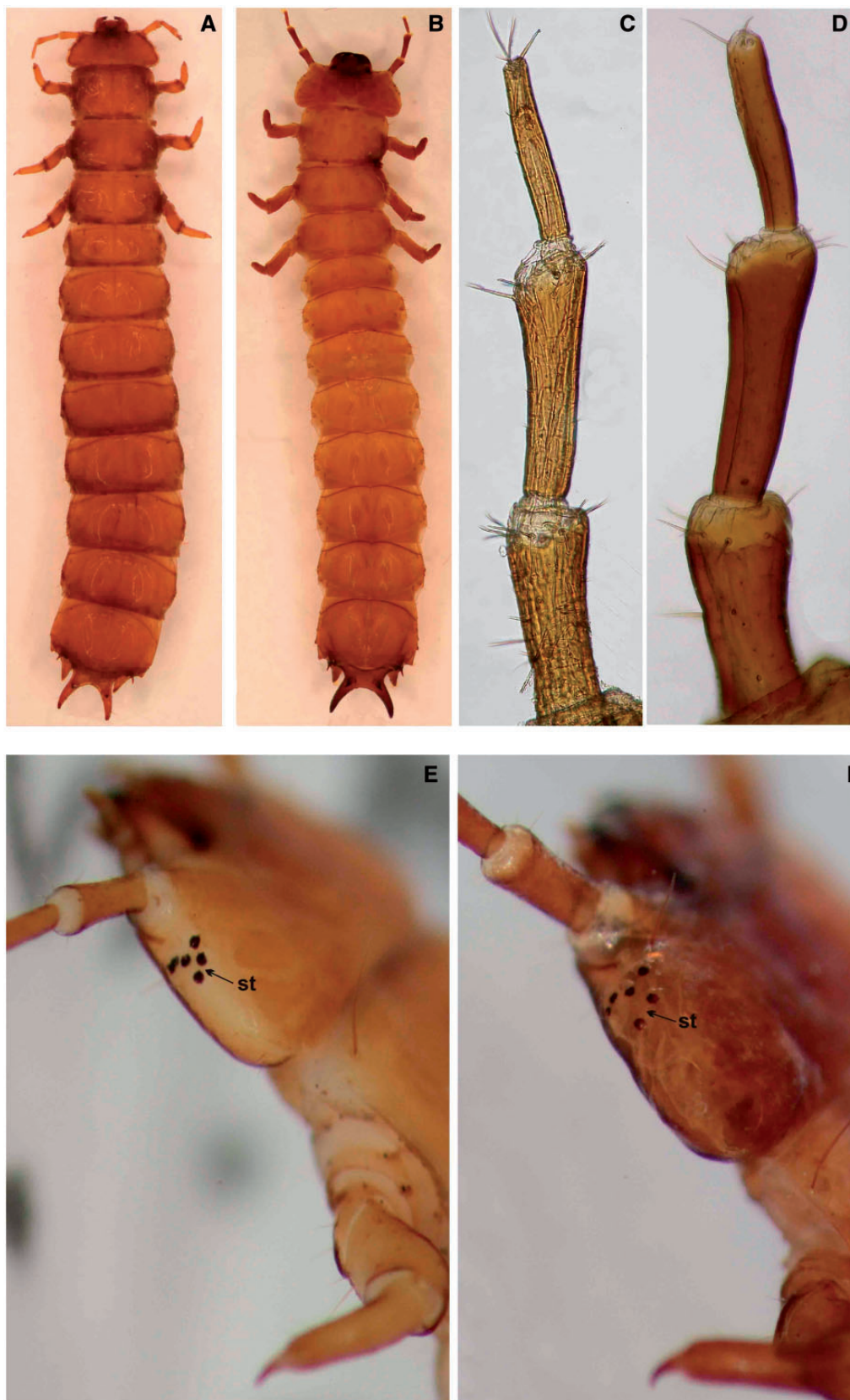
Fig. 1. Larva of C. cinnaberinus . (A) Habitus (dorsal view). (C) Antenna. (E) Head with stemmata (lateral view). Larva of C. haematodes . (B) Habitus (dorsal view). (D) Antenna. (F) Head with stemmata (lateral view). st stemmata.