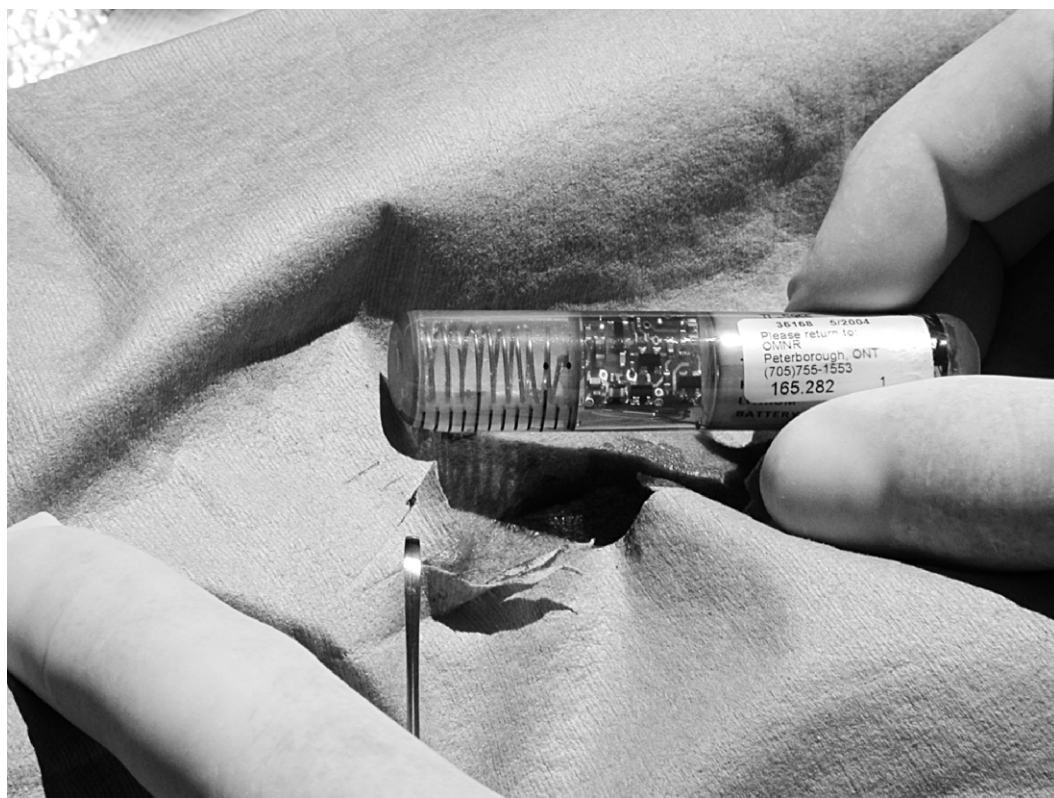
FIGURE 1. A detailed view of an intraperitoneal VHF radio transmitter (7.9-cm length \times 1.7-cm diameter; ATS, Isanti, Minnesota, USA) prior to insertion into the peritoneal cavity of a 5-wk-old wolf pup in Algonquin Provincial Park. The implant consisted of a lithium battery (right), circuit board (middle), and a coiled antenna (left) packaged in a biologically inert resin.

Animal Health, Guelph, Ontario, Canada) (0.1 mg/kg) for sedation and intra-operative analgesia. Anesthesia was then induced with 8% sevoflurane (Sevoflurane, Abbott Laboratories, St. Laurent, Quebec, Canada) in oxygen with a flow rate of 2–3 l/min via a tight-fitting anesthetic face mask. The anesthetic apparatus consisted of a precision sevoflurane vaporizer (Penlon Sigma Delta, Penlon Ltd., Abingdon, Oxon, UK), a D- or E-size aluminum oxygen cylinder, a dial-up combination regulator/flowmeter (Model 3108-L, Inovo Inc., Naples, Florida, USA), a Bain's anesthetic circuit, and a 2-m hose for waste gas. Total weight of the apparatus including the aluminum oxygen cylinder was 11.4 kg with the E-size cylinder, and just 9.7 kg with the smaller D-size cylinder.