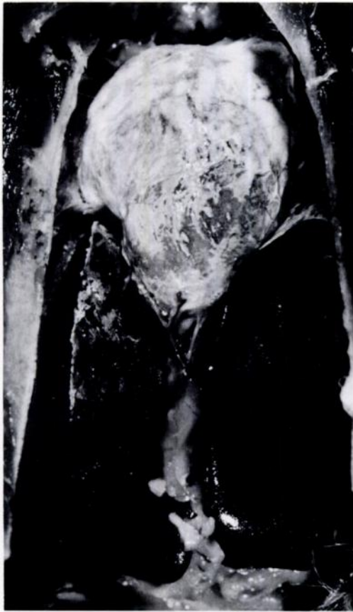
FIGURE 1. White, adherent, flake-like urate crystals on pericardium, air sacs and surface of liver. Note diffuse pinpoint white foci on liver.