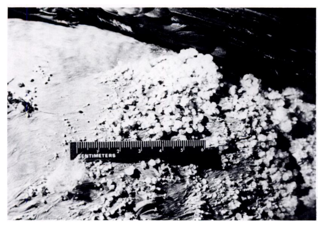
FIGURE 2. Salt accumulation on feathers of Canada goose that died of salt poisoning at White Lake, North Dakota.

and/or released after gaining access to fresh water, and (5) no evidence of other toxic, traumatic or infectious diseases.