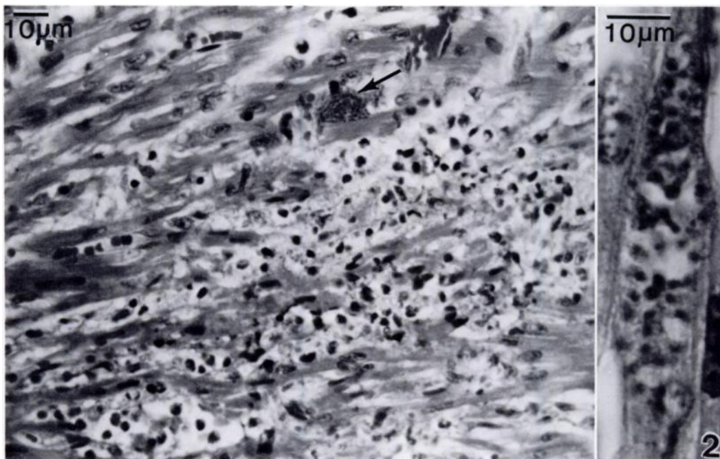
FIGURE 2. Myocardium of bobcat showing necrosis of myocardial fibers, infiltrations of leukocytes, and a group of T. gondii tachyzoites (arrow). H&E. Inset shows a group of tachyzoites within a myofiber. H&E.