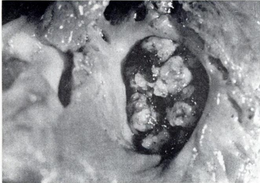
Figure 1. Mitral valve showing typical vegetative lesion of subacute bacterial endocarditis.

tional area due to the extensive involvement of the valve leaflets. The annulus and immediately adjacent valvular tissue was grossly free of pathology.