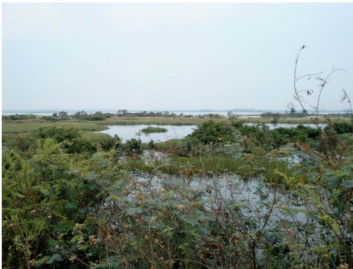
Figure 2. Nong Souy, Savannakhet province, Lao PDR, 3 March 2007, showing the bush-studded wetland typical of non-urban sites with Yellow-vented Bulbul records in Lao PDR. The foreground bush is the invasive American Mimosa pigra , which is also spreading rapidly in Lao.

attributing their changes in status in Lao PDR to genuine expansion.