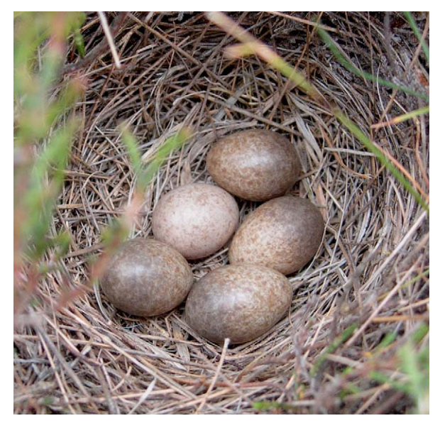
Figure 1. Clutch of four Skylark eggs and one Cuckoo egg (based on coloration and size supposedly middle left). Picture taken by Rob Voesten, 27 May 2009.

On 27 May 2009 we discovered an incubated Skylark nest with 5 eggs (Fig. 1). On 3 June (around noon) three young Skylarks had hatched (day 0); two eggs were still remaining, and we did not realise at that time that one was a Cuckoo egg. We did not visit the nest on 4 and 5 June. At 5:45 on 6 June, we found a young Cuckoo in the nest, and two of the four Skylarks chicks (age of all day 3) were out of the nests, probably ejected by the Cuckoo chick. The two young out of the nest