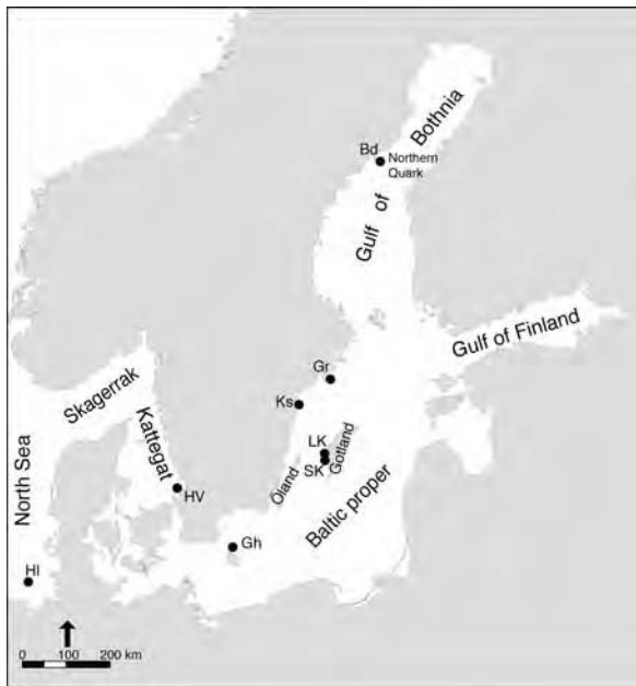
Figure 1. Map of the Baltic Sea and adjacent sea areas, with geographical names mentioned in the text. Bd Bonden, Gh Gräsholmen, Gr Grän, Hl Helgoland, Hv Hallands Väderö, LK Lilla Karlsö, SK Stora Karlsö and Ks Källskären.

duals were landed at five occasions; 11 November 1987 (13 specimens), 28 October 1988 (4), 2 November 1988 (10), 29 November 1988 (50) and 14 November 1989 (72), respectively.