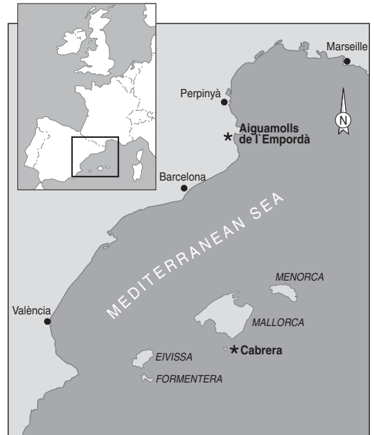
Figure 1. Map of the western Mediterranean showing the locations of the ringing stations used in this study.

For this study we analyzed data from two ringing stations, one located on the northeastern coast of the Iberian Peninsula (Aiguamolls de l'Empordà Natural Park) and the other on the small island of Cabrera at the Balearic Islands (Fig. 1). The continental station of Aiguamolls de l'Empordà (42°00'N, 3°00'E) is located at a marshy area which is dominated by Common Reed Phragmites australis . Cabrera (39°08'N, 2°56'E) is a small island located 10 km south of the large island of Mallorca and has a Mediterranean open-shrub vegetation with a small pine forest. Contrary to the mainland station, the island does not have marshy habitats. Data from the PPI is based on continuous and standardized mist-netting on Mediterranean islands and some mainland stations (Spina et al.