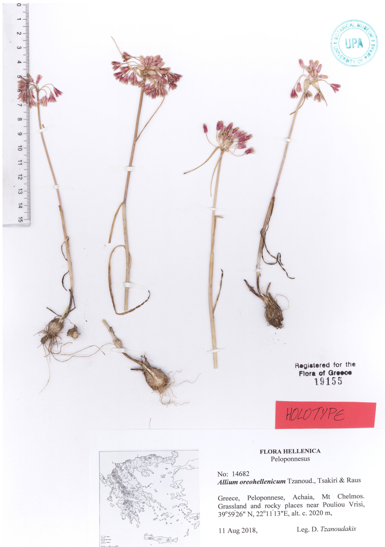
Fig. 4. Holotype of Allium oreohellenicum Tzanoud., Tsakiri & Raus, Tzanoudakis 14682 (UPA).