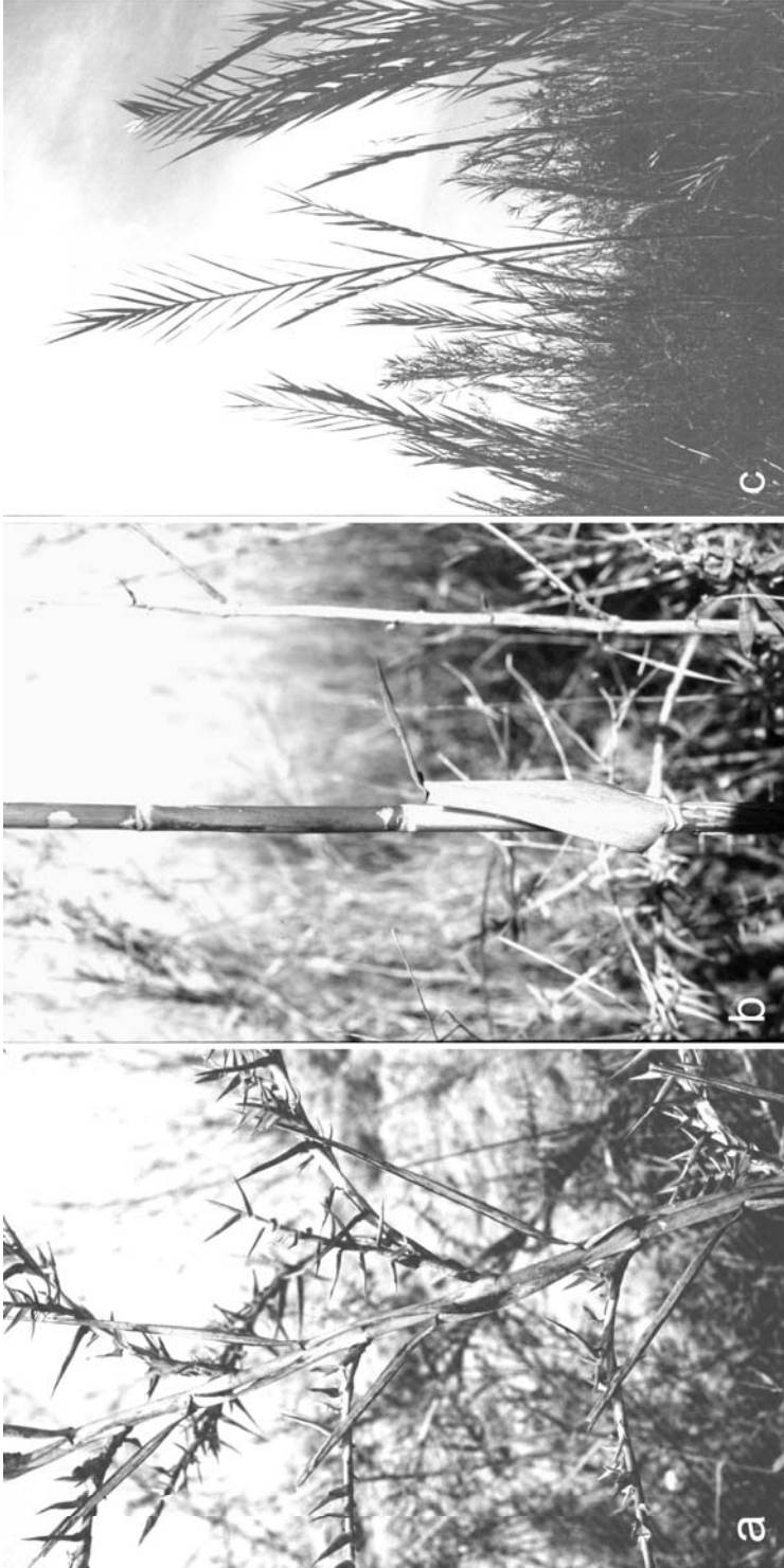
Fig. 2. Phragmites frutescens – a: mature main stem with sterile side branches, loose leaf sheaths and totally abscissing leaves; b: mature stem being naked (after natural abscission of mature lower leaves), shiny, suffused with red, woody; c: phoenicoid shoots, grown up to c. 4 m tall culms with 3 cm diameter at base (in first season), partly with syzyptic branching. –, a: Greece, Crete, Asproulani, 16.4.1998, b: ibid., 9.11.1998, c: Greece, Chalkidiki, Sithonia peninsula, between Neas Marmaras and Lagomandra, 20.9.1999.