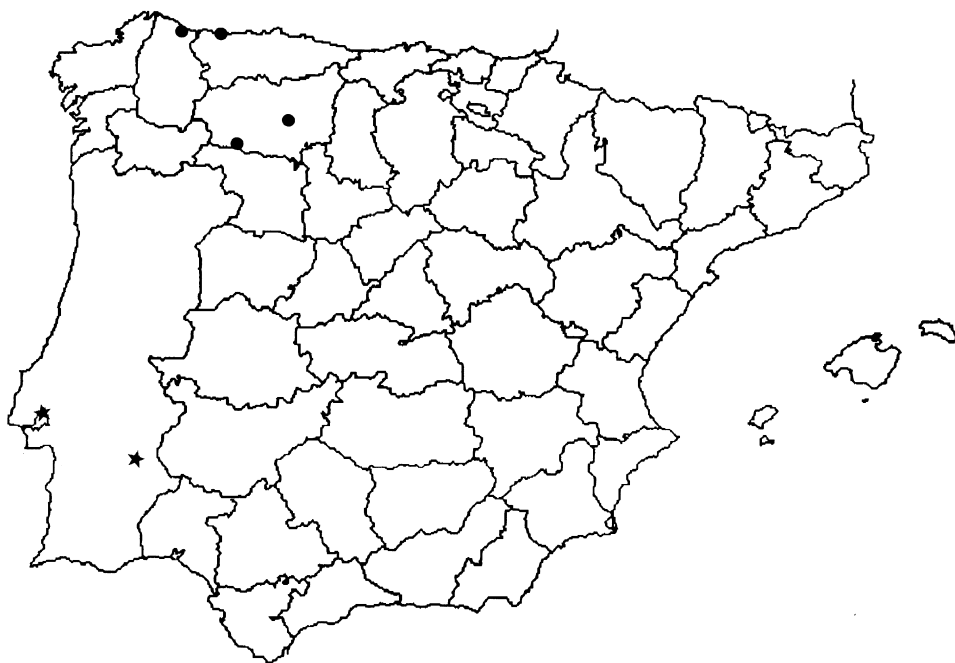
Fig. 2. Distribution of Bromus cabrerensis ● and B. nervosus ★.

800 µm thick, interrupted by a central cavity of 200–1700 µm in diameter. Epidermis with some prickles and macrohairs.