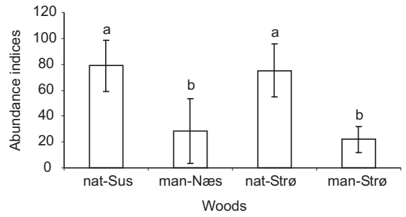
Fig. 1. Abundance index (all species/day) in the four forests. Identical letters indicate no significant difference between indices based on pairwise Turkey-Kramer Tests at p > 0.05 significance level. Sig-nificant differences at p < 0.001

It was assumed that the number of foraging observations serves as a good measurement of bird abundance in the forests (Table 1). Based on this assumption an abundance index was calculated as the average number of 1 st obs./day. The number of foraging observations was generally much higher in the natural old-growth forests than in the intensively managed ones. Daily mean number of observations in nat-woods were 76.9 ± 22.3 compared with 24.9 ± 16.3 in man-woods. The abundance indices in the forests for all species pooled was found to be significantly different (Repeated measures ANOVA based on