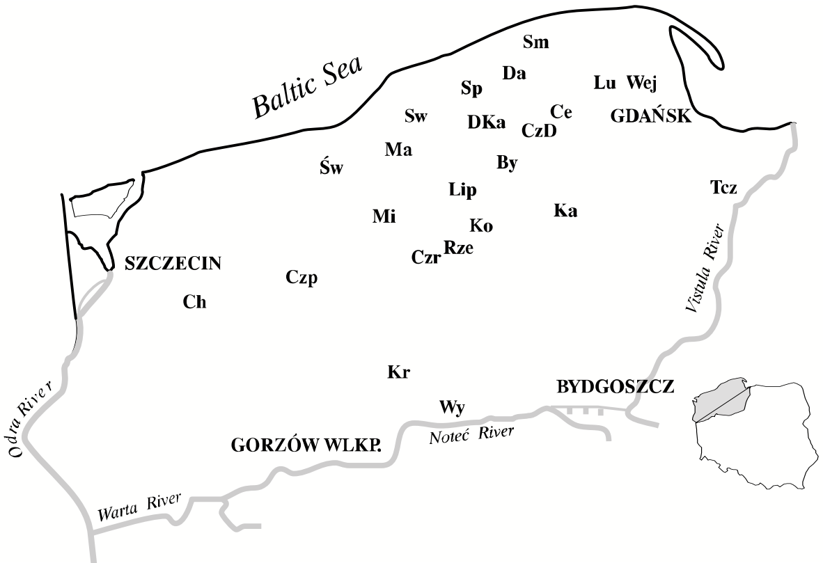
Fig. 1. Distribution of the sample plots studied within the area of Pomerania (NW Poland). 1–23 localities as in Table 1.