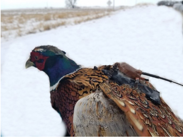
Figure 2. Self-made, low-cost GPS tracker weighing 43 g (<5% of body mass) attached to a male ring-necked pheasant in Beadle County, South Dakota, 2019.

captured wild male and female pheasants using cylindrical walk-in traps (12' × 3') with two funnel entrances (8" × 8") baited with corn Zea mays from January to March 2019. Pheasants were weighed to verify that trackers were within ≤5% of body mass (IACUC 16-086A) and were monitored four days per week. GPS trackers were retrieved upon detection of the activated mortality switch on the VHF transmitter.