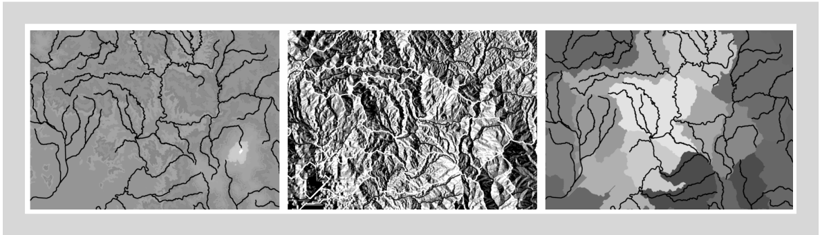
Figure 2. Given the Digital Terrain Model, GRASS can identify automatically river basins with a single command (i.e. r.watershed ).