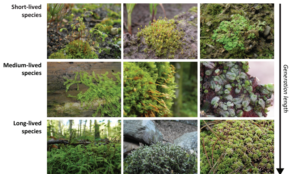
Figure 1. Examples of species with different generation lengths. Species from top left to down right: Funaria hygrometrica (fugitive), Tortula truncata (annual shuttle), Riccia glauca (annual shuttle), Lophocolea heterophylla (pioneer colonist), Ulota bruchii (short-lived shuttle), Exorotheca pustulosa (short-lived shuttle), Brachythecium rutabulum (perennial stayer), Hedwigia ciliata (long-lived shuttle), Sphagnum capillifolium (dominant; photos: A. Bergamini).

The definitions of 'individual-equivalents' as outlined above closely follow the Red List Guidelines (IUCN SPSC 2017), but they are more precise and also more explicit than those originally suggested by Hallingbäck (2007). They are used in all cases where identification of 'mature individuals' is not possible. For the European Bryophyte Red List, each individual Red List assessment of a species