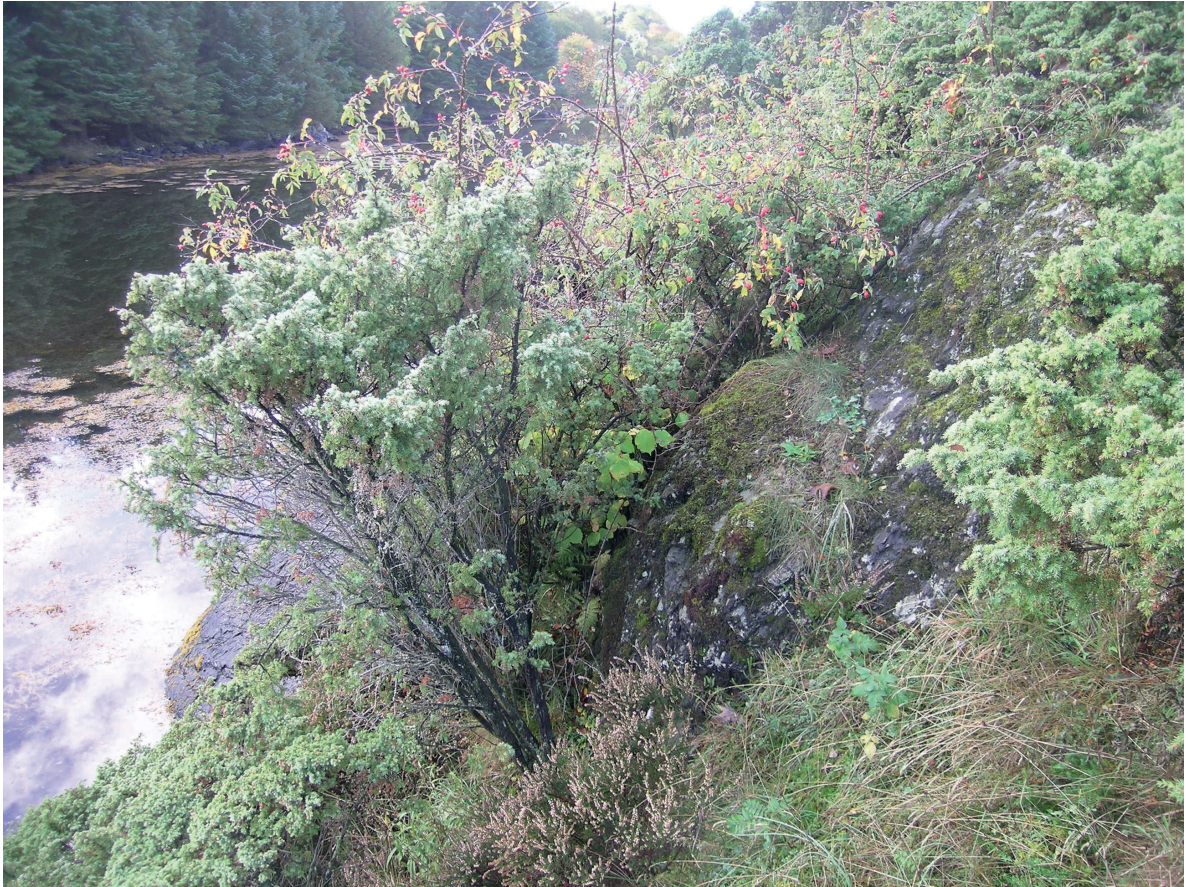
Figure 5. Shrub encroachment, due to reduced grazing by livestock, is a general threat that applies to most localities of P. obtusata , like here at Bømlo, Hordaland. (Photo J. B. Jordal).

least eight localities are threatened by habitat loss due to construction work (Fig. 4, Table 1).