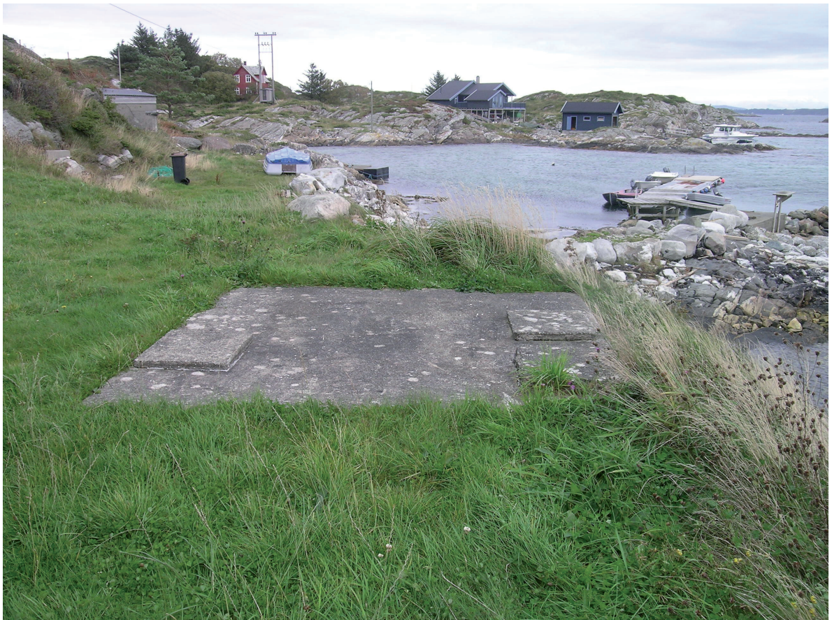
Figure 4. At least eight localities of P. obtusata are threatened by habitat loss due to construction work, like here at Litla Kalsøy in Austevoll, Hordaland.

Two of the 34 localities were destroyed due to fertilization by use of wet manure, and building of houses. At