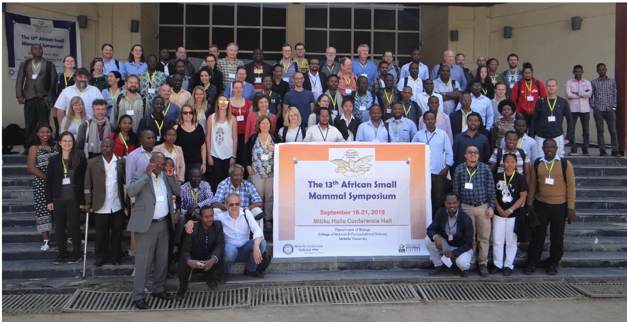
Fig. 2. Group photo of participants of the 13 th ASMS in Ethiopia.

Madagascar. For the first time there were also presentations about population and conservation genomics, niche modelling and a special session on subterranean rodents. The abstract book from this meeting is available at https://asms2019.ivb.cz/wp-content/uploads/12thASMS_Madagascar.pdf .