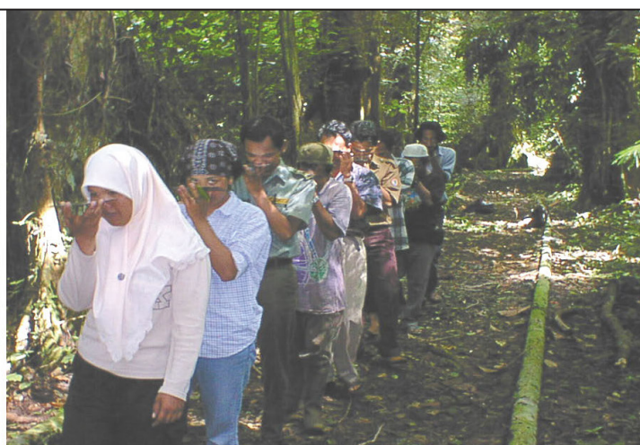
Figures 8 and 9. Activities at the Sibolangit Interpretive Education Center (Photos © Conservation International).