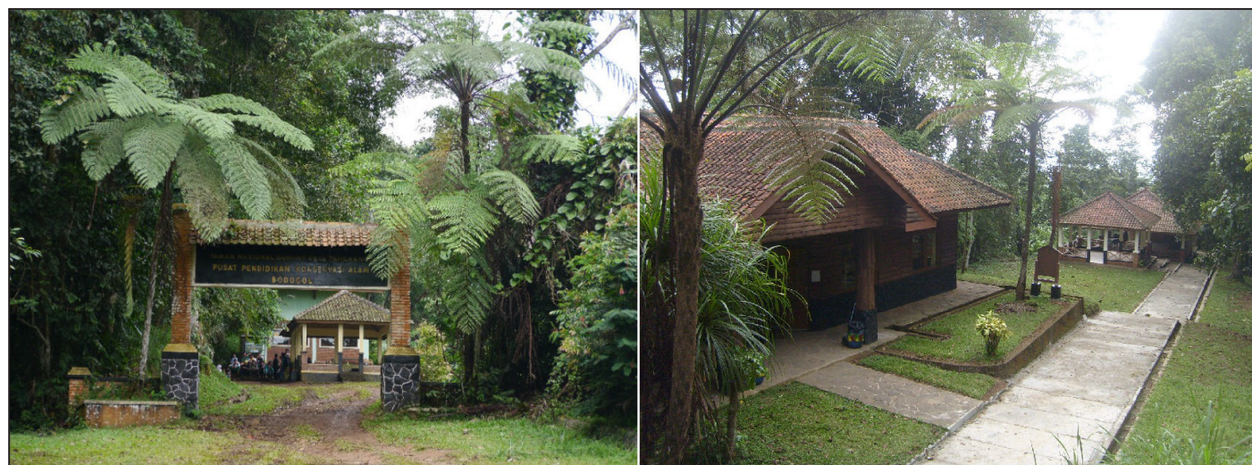
Figures 2 and 3. The Bodogol Conservation Education Center.