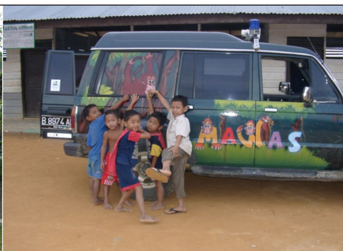
Figures 10 and 11. Vehicles used to visit villages and schools.