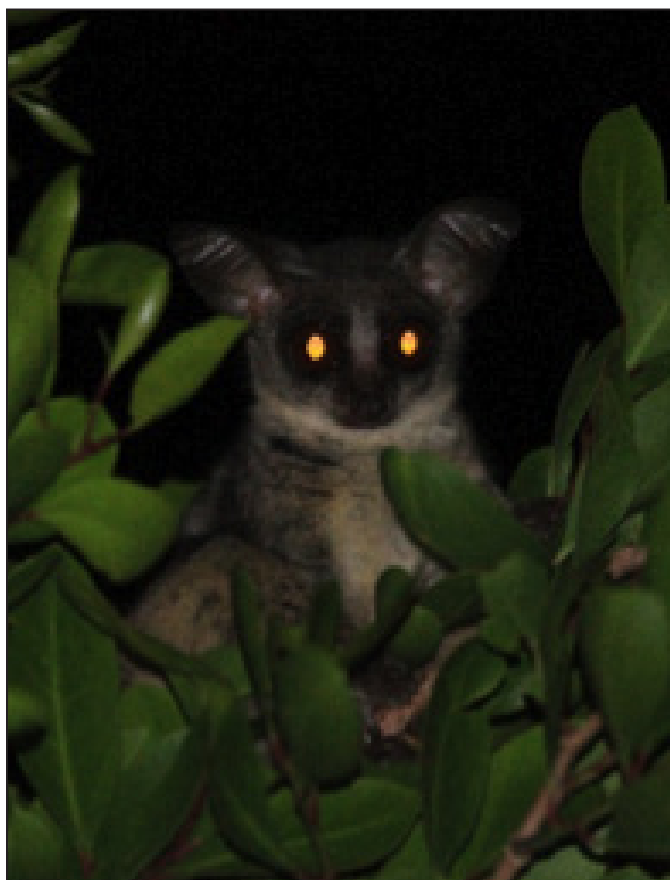
Figure 3. Galago senegalensis observed on the edge of Pama Partial Reserve, Burkina Faso.

Sightings of E. patas were rare, with a total of only five encounters: Pama (1 individual); Arly (one group); Comoé (none); Koulbi (two groups); Nazinga (one group) (Tables 2 and 4). The average observed group size was 2.25 individuals, although patas were difficult to see and quick to flee. The one individual we saw in Pama was well-known to park officials and employees who reported that it had been alone for 10 years. In Koulbi, where group encounter rates were