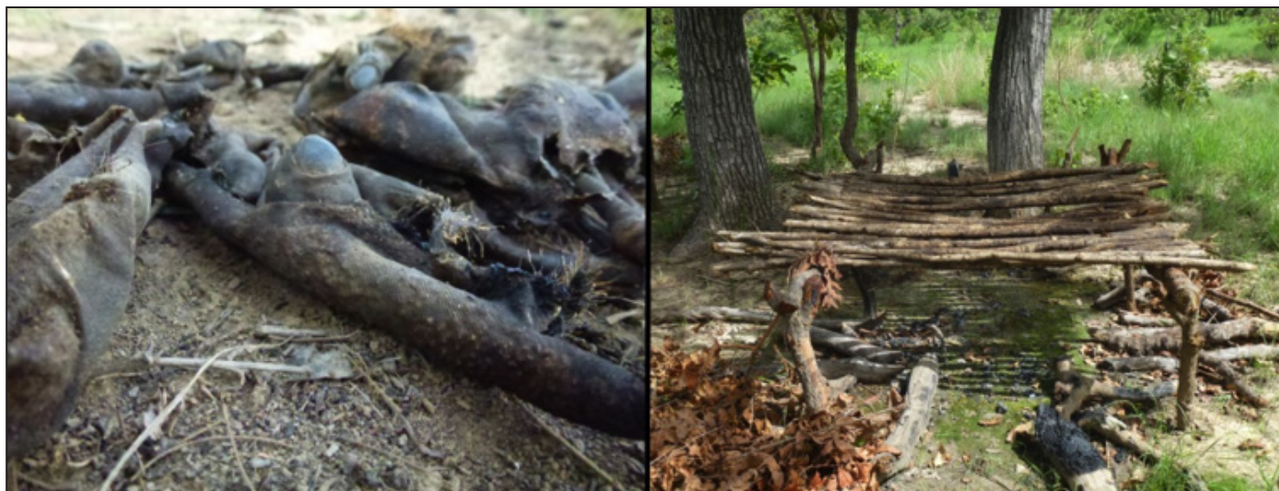
Figure 6. The hands and feet of Papio anubis (left) found near a poaching camp (right) in Comoé-Léraba Partial Reserve, Burkina Faso.