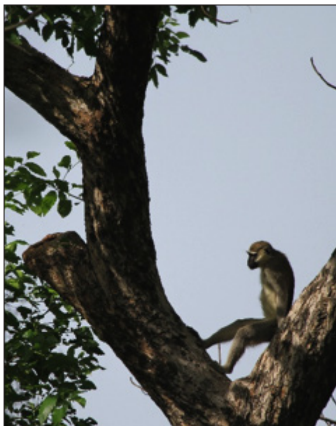
Figure 5. Chlorocebus tantalus in Arly National Park, Burkina Faso.

Our interviews with park officials and anti-poaching patrollers revealed an overall lack in anti-poaching patrol effort and the inability of patrollers to enact the laws in place. These individuals are often placed in dangerous situations, but have been fined or even imprisoned for retaliatory action. Effective and consistent law enforcement in protected areas is vital to species’ survival (Hilborn et al. 2006; Tranquilli et al. 2011; N’Goran et al. 2012). We recommend that the MOE implement a uniform system for assessing and managing wildlife across its protected areas (for example, incorporating data collection into anti-poaching patrols) and that anti-poaching patrollers are trained as law enforcement officials with the authority to detain and prosecute individuals.