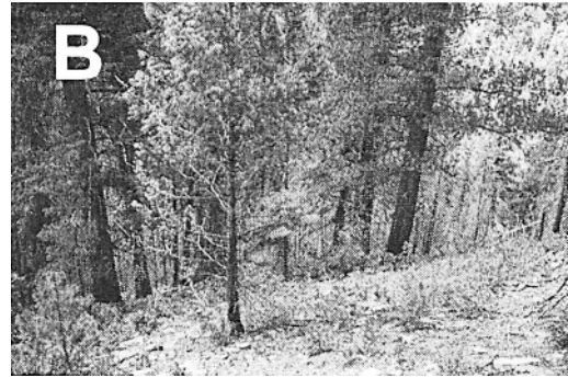
FIG. 3—Examples of Plethodon neomexicanus habitat in New Mexico taken in 2000: A) in an area burned with high-severity at a previously known location, and B) in an unburned area (fire-suppressed) at a previously known location.

in temperatures between burn-severity types are likely due to intrinsic site differences (Table 1), the temperature differences were so extreme that the intrinsic site variation is likely not a considerable factor. Furthermore, the extreme temperature differences are likely a result of different canopy cover between burn-severity types (Table 1, Fig. 3). Increased canopy cover