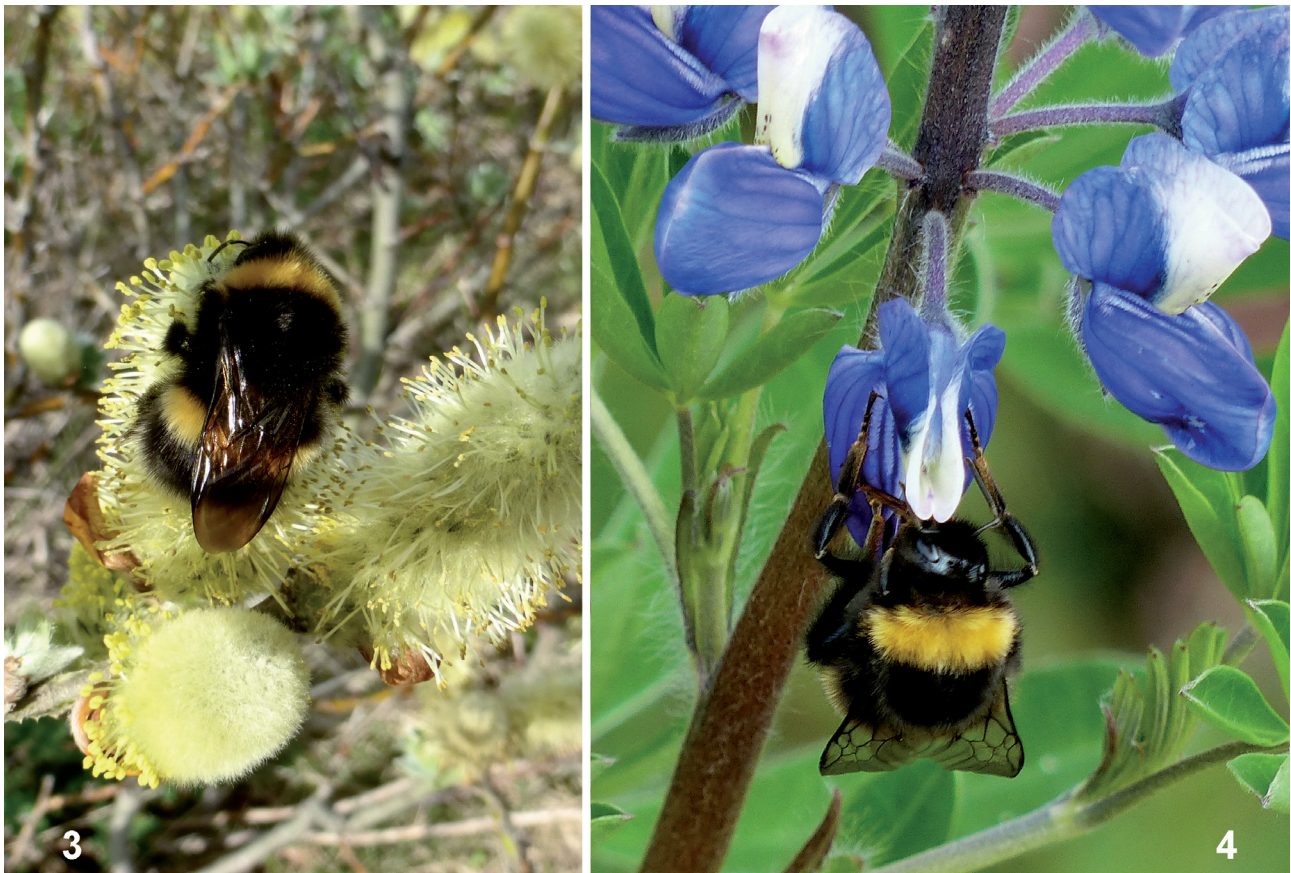
Figs. 3–4. Bombus lucorum queens visiting flowers in Iceland. – 3. Salix lanata (Bakkagerði, Höfn, 4.VI.2014). 4. Lupinus nootkatensis (Húsavík, Laxá, 8.VI.2014). – Photos: A. SCHWABE.

and snow. If we suppose that 177 grids are not ice- or permanently snow-covered, until today B. jonellus has been observed in 58 grids (33 %).