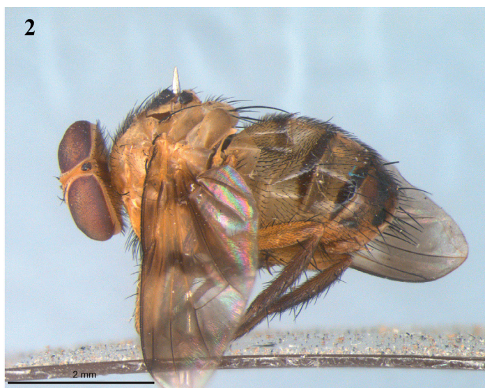
Figs. 1–2. Cenosoma catiae sp. n., lateral habitus. 1. Holotype female. 2. Male paratype.