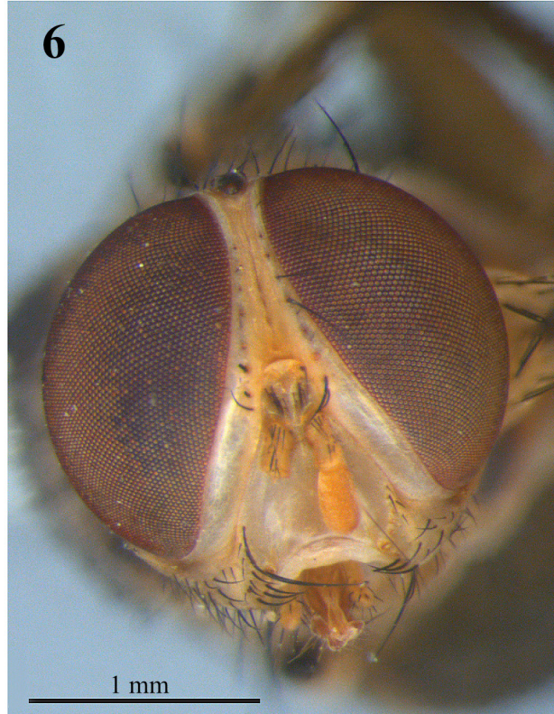
Figs. 3–6. Cenosoma catiae sp. n., dorsal habitus and head in frontal view. 3, 4. Holotype female. 5, 6. Male paratype.