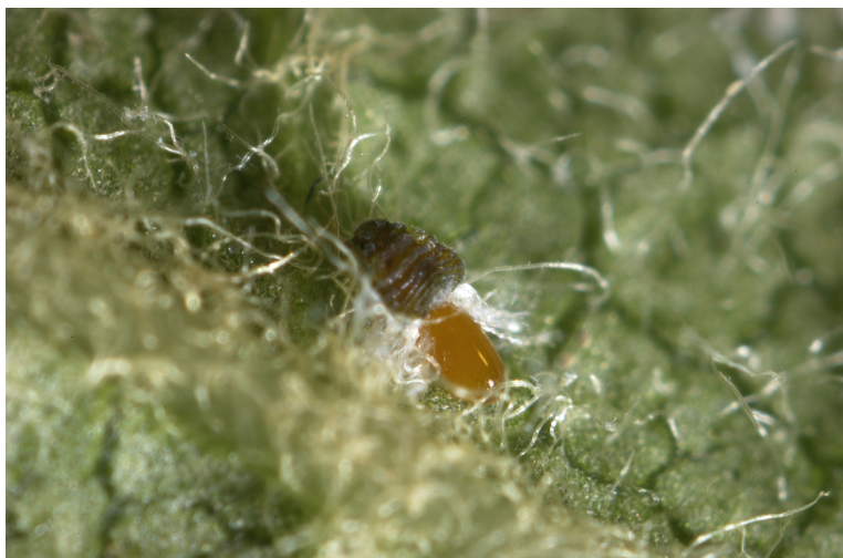
Figure 4. Woolly apple aphid oviparous female; laying an egg on the abaxial surface of an apple leaf.

reported by others: Baker (1915) 0.64 mm x 0.288 mm; Monzen (1925) 0.55mm x 0.35 mm; Asante (1994) 0.58 \pm 0.01 mm x 0.33 \pm 0.01 mm wide. Eggs are mostly laid on the abaxial surface of apple leaves and occasionally are found covered with wool secreted by the oviparous female. The female dies soon after laying the egg. More sexual morphs and eggs were found on leaves collected from apple trees grown in the glasshouse ( 7.6 \pm 0.93 sexual morphs and 3.5 \pm 0.60 eggs per tree) than from the trees grown outside ( 1.0 \pm 0.39 sexual morphs and 1.3 \pm 0.34 eggs per tree). In addition, more alates were seen on the leaves collected from the glasshouse.