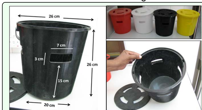
Figure 1. Red palm weevil trap dimensions (left), tested colors (upper right), and trap inside and lid (lower right). High quality figures are available online.

In the current study, the trap color was the color of the plastic material itself (original color), whereas in Al-Saoud et al. (2010), the traps were white and experimentally sprayed with different paints (painted color). A total of 48 traps were installed in four locations in the field. Each location was a date palm plantation in which four trap colors (white, yellow, red, and black) were tested. Each trap color was represented by three traps (replications) per location. Trap surface color values ( L^*a^*b ) were measured by a chromameter (Table 1). The L -value is the