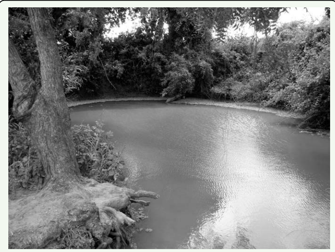
Figure 1. Photograph of the study site near the village of Saduase, Ga East District, Ghana. High quality figures are available online.

mosquitoes may be involved in transmission (Johnson et al. 2007).