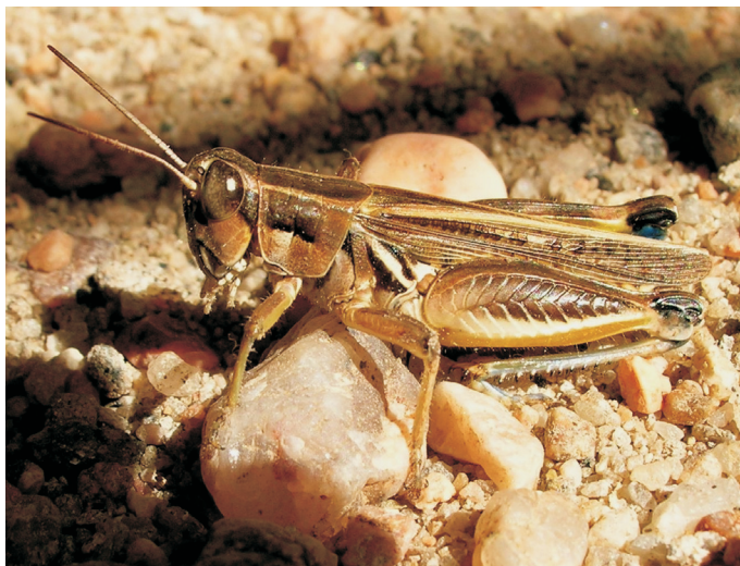
Fig. 2. Dichroplus pratensis male, natural population at Saladillo, San Luis, Argentina, summer 2006. See Plate IV.