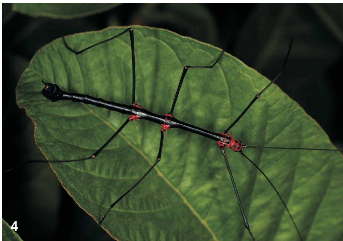
Fig. 4. Oreophoetes topoense n. sp. ♂ PT (in OC). See Plates.