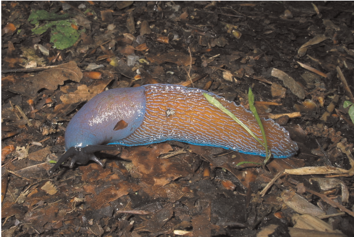
FIGURE 3 The endemic Carpathian blue slug, Bielzia coerulans .

Carpathians (Kozak et al 2007a); for such studies, access to historic Austro-Hungarian maps is crucial.