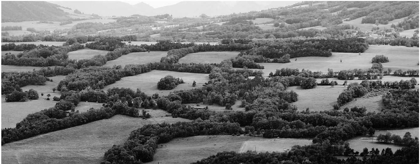
FIGURE 2 A well-structured landscape offers a habitat for a variety of species.

outset of the local and regional planning process (municipalities, regional authorities).