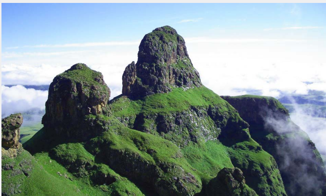
FIGURE 3 The ARU welcomes collaborations and partnerships to study southern African mountains as social–ecological systems and to achieve a science–policy–action interface for their sustainable development. (Photo by Ralph Clark; The Camel, ~2800 m, Cathedral Peak Area, uKhahlamba–Drakensberg Park and UNESCO World Heritage Site)

The ARU welcomes collaborations from across southern Africa, the Africa continent, and globally that align with our vision and mission and seek to partner with us to achieve our objectives for a sustainable future for southern African mountains (Figure 3).