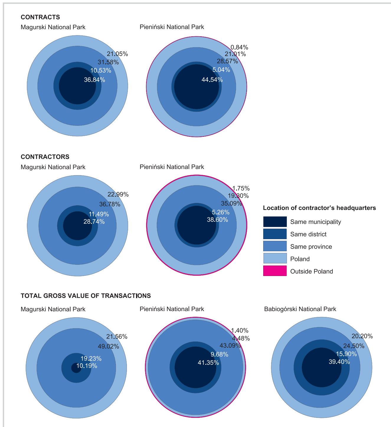
FIGURE 2 Spatial distribution of contracts awarded by Magurski (2010–2014), Pieniński (2012–2016), and Babiogórski (2010–2014) National Parks, by contractor's location in relation to the park. Data sources: park records provided directly to the author (Magurski) or found online (Pieniński); for Babiogórski, Mika et al (2015: 94).

headquarters, although bigger enterprises from 2 other park municipalities had contracts with greater total value.