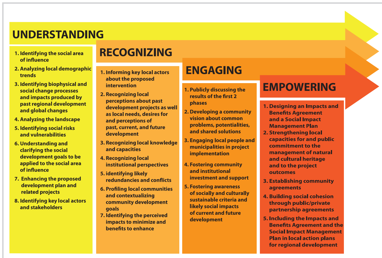
FIGURE 3 The 4 phases of the SIA Framework for Action. (Adapted from Vanclay et al 2015)

perspectives on development or their levels of trust. A demographic trends analysis helps to understand the structure and dynamics of the local population and its demographic and social change processes. A landscape analysis helps identify natural and cultural heritage resources and their state of conservation by contributing an understanding of the influence of past social change processes on the patterns of land use, for example urbanization and coastalization (see Vanclay 2002).