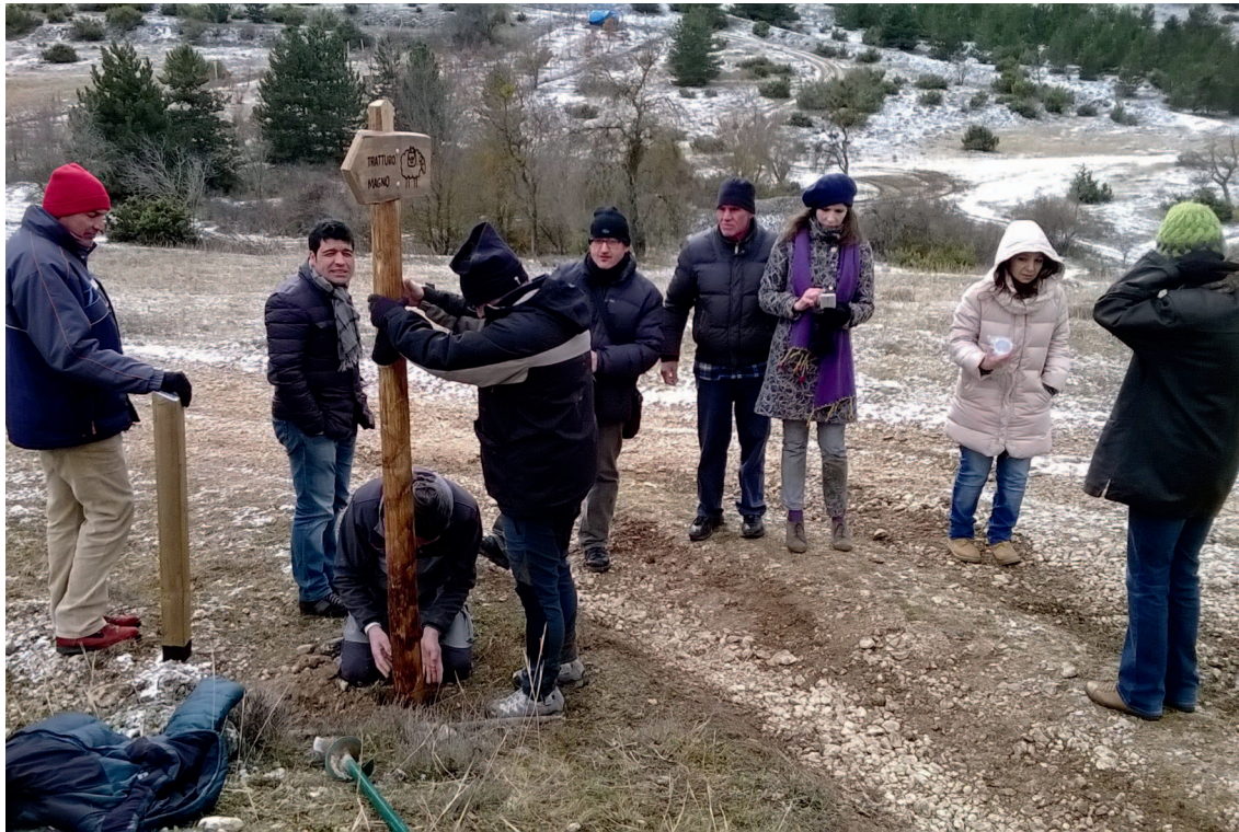
FIGURE 5 Members of a local community group erecting handmade wooden signs outside the mountain village of San Demetrio Ne' Vestini on the Tratturo Magno path. The village mayor is second from left. The shorter post displays a QR code to access information about the site.

Tratturo Magno project outcomes, especially in relation to the need to better manage the restored path and local cultural and natural heritage. These discussions, which were continued in the fourth phase of the SIA Framework for Action, resulted in the creation of a legal entity, the network agreement Landscapes in Transhumance.