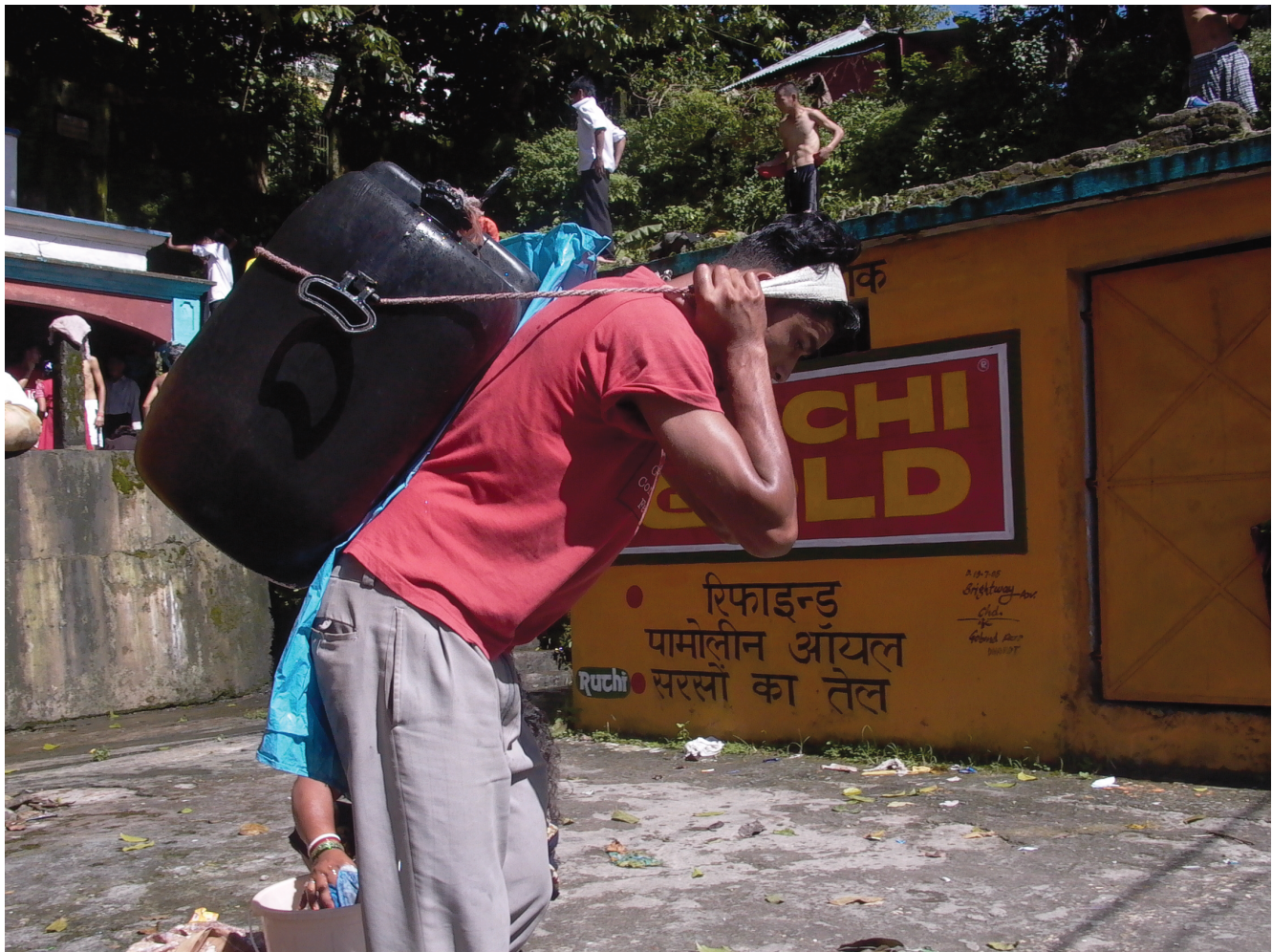
FIGURE 3 The Baghdara spring in the morning.

that the water is contaminated. We will not supply water till the matter is sorted out to our satisfaction. (Ravidas 2012)