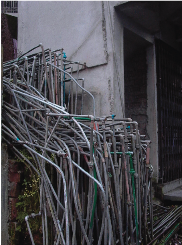
FIGURE 2 Water supply pipes in Kalimpong town.

relationship is crosscut by ethnicity, class, caste, color, race, and religion, and evolves spatially and temporally, resulting in varying experiences for different women, or, for that matter, for different men as well. This article speaks of similar ambiguities: on the one hand of subdued gendered priorities in a patriarchal, coercive political domain, and on the other, of serious challenges to a politics of solidarity among a diverse group of women with differing needs, challenges, and individual priorities, in a context of serious environmental problems.