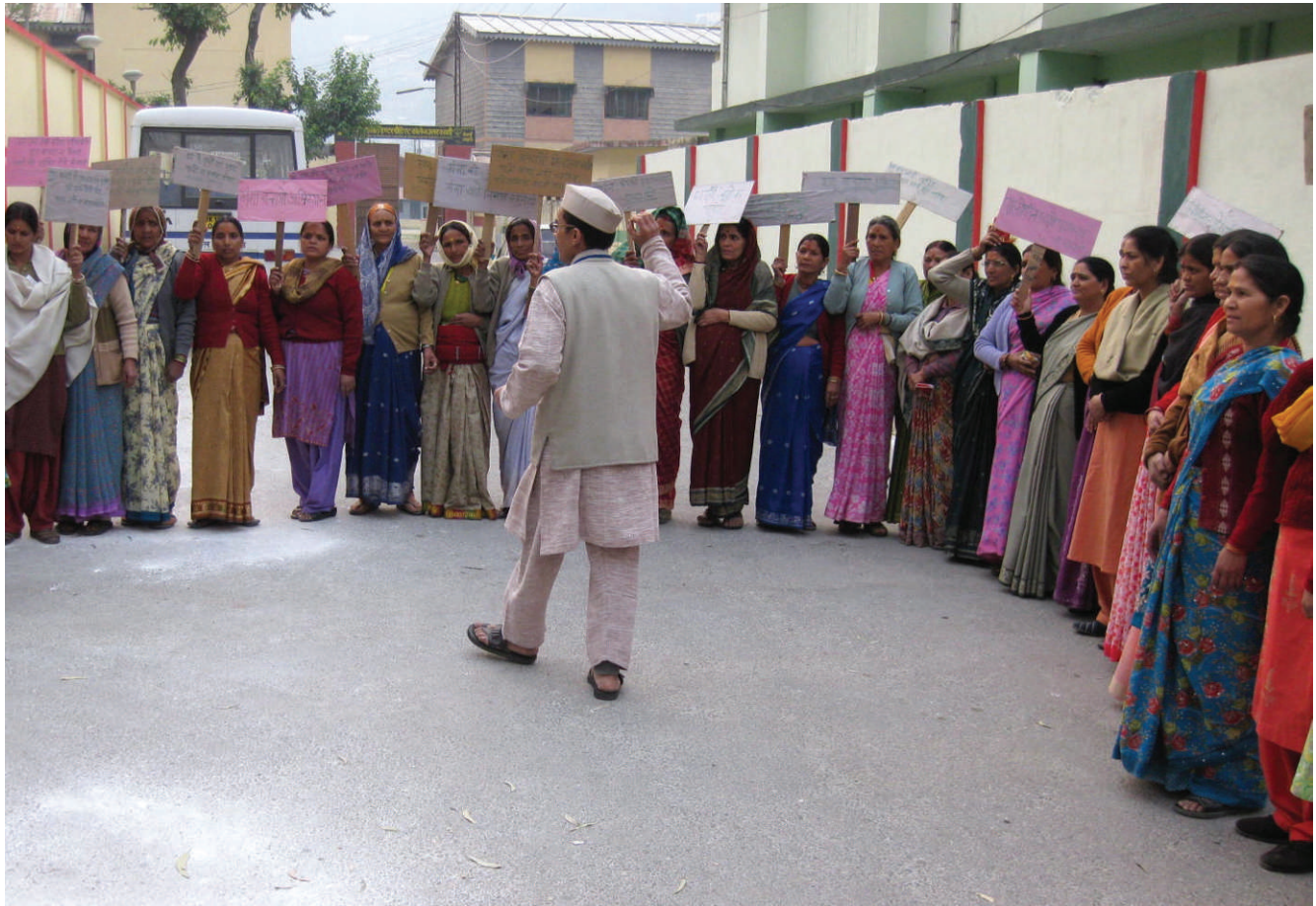
FIGURE 3 Man leading a rally during a “Save the Ganga” campaign.

worried that the Ecologically Sensitive Zone he campaigned for would also lead to the creation of a conservation zone that would leave little room for mountain residents to demand and realize regionally appropriate development measures such as microdams on small tributaries and other projects that could be designed with a lighter ecological footprint while promoting regional employment.