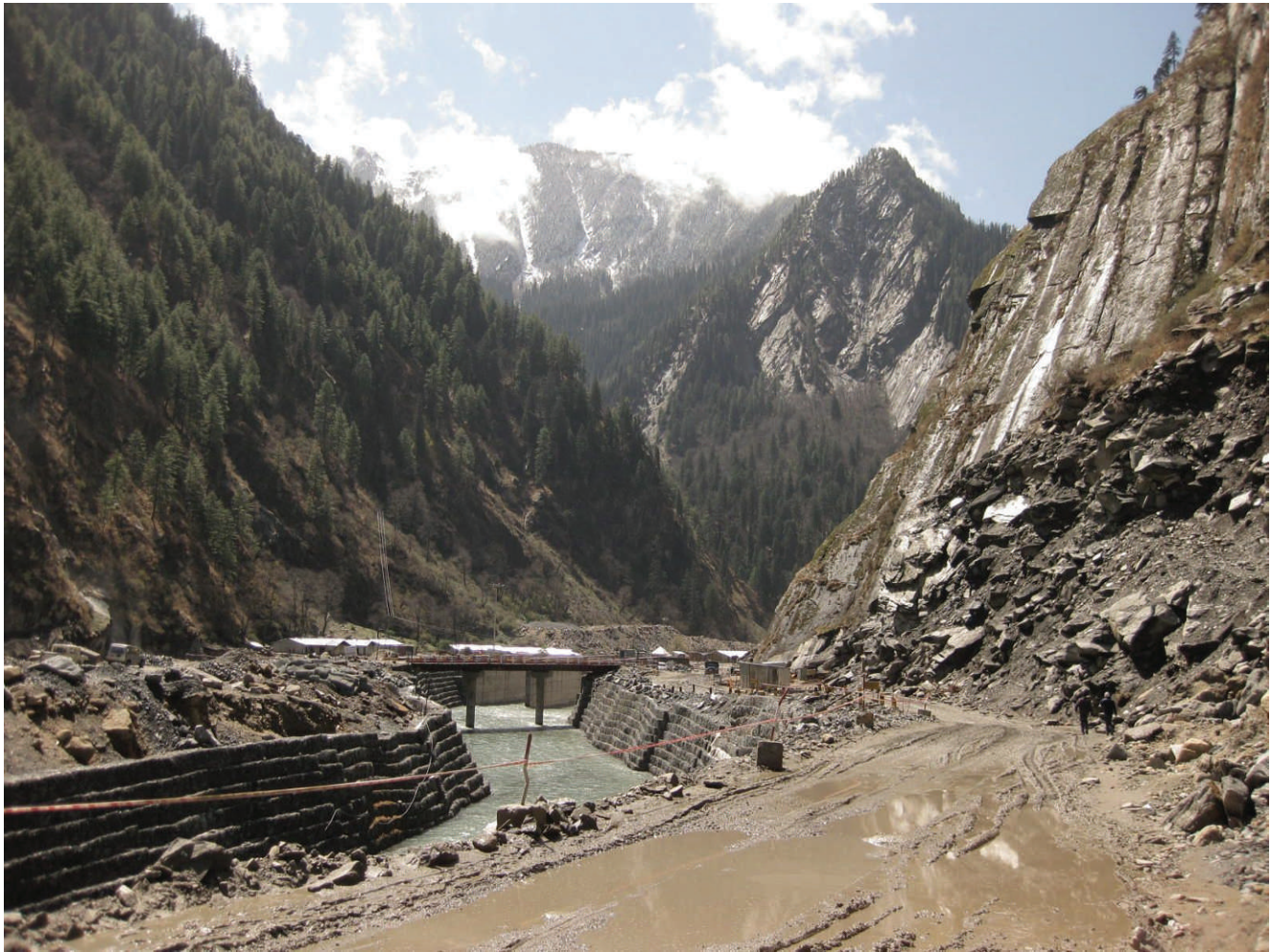
FIGURE 1 Road construction and water diversion for the Loharinag Pala Hydel project.

Sikkim (Chandy et al 2012). Some of the construction activities involved occasional roadblocks and other disturbances that hindered the flow of pilgrimages and tourism, a seasonal mainstay of the regional economy. Several fatal car accidents were also attributed to the hastily created infrastructure, including roads that crumbled under the weight of large vehicles. In 2009, a bus with schoolchildren, teachers, and villagers tumbled down a ravine near a dam construction site. Several other cars suffered similar fates, though it is difficult to tell whether the cause was the roads or the monsoon rains that chip away at the hillsides.