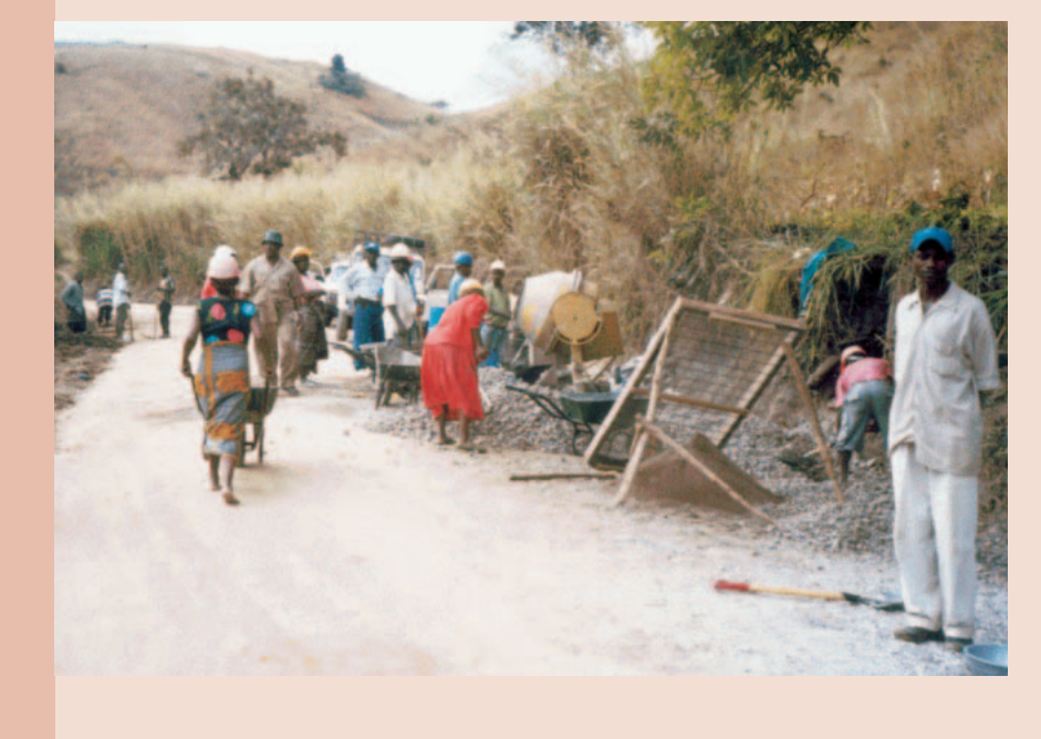
FIGURE 1 Local people rehabilitating the Mlali to Mgeta road in the Uluguru mountains.

Another DRSP strategy is the use of technology for road improvement adapted to financial constraints. Rehabilitation follows strict prioritization and use of low-