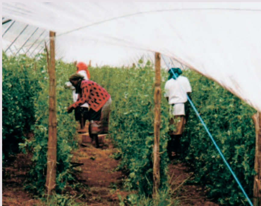
FIGURE 2 Horticultural production: the conversion of former livestock–wheat field systems into large-scale irrigated horticulture in the footzones of Mount Kenya has introduced a new dimension of water demand in the area.

In view of this complex social structure and the rapidly growing population,