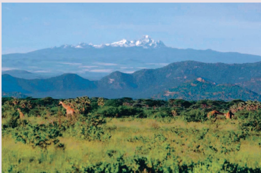
FIGURE 1 The Mount Kenya highland–lowland system.

The basin is characterized by highly diversified ecological systems and zonal differentiation. It includes the nival mountaintop, the moorlands above the timberline, a belt of tropical rainforest, the semihumid footzone of the tertiary volcano, the semiarid high Laikipia Plateau, the escarpment, and the semiarid to arid Samburu Plains. The ecological