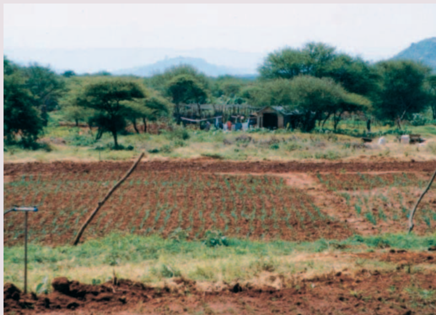
FIGURE 3 Crop production in the marginal pastoral area: the demand for water continues to grow as more marginal areas further north are used for irrigation agriculture.

with ensuing social, cultural, racial, economic, and political disparities, a key challenge is to achieve equitable universal allocation and distribution of river water resources. Further complications of the issue are (1) that people perceive water as a God-given resource—with the implica-