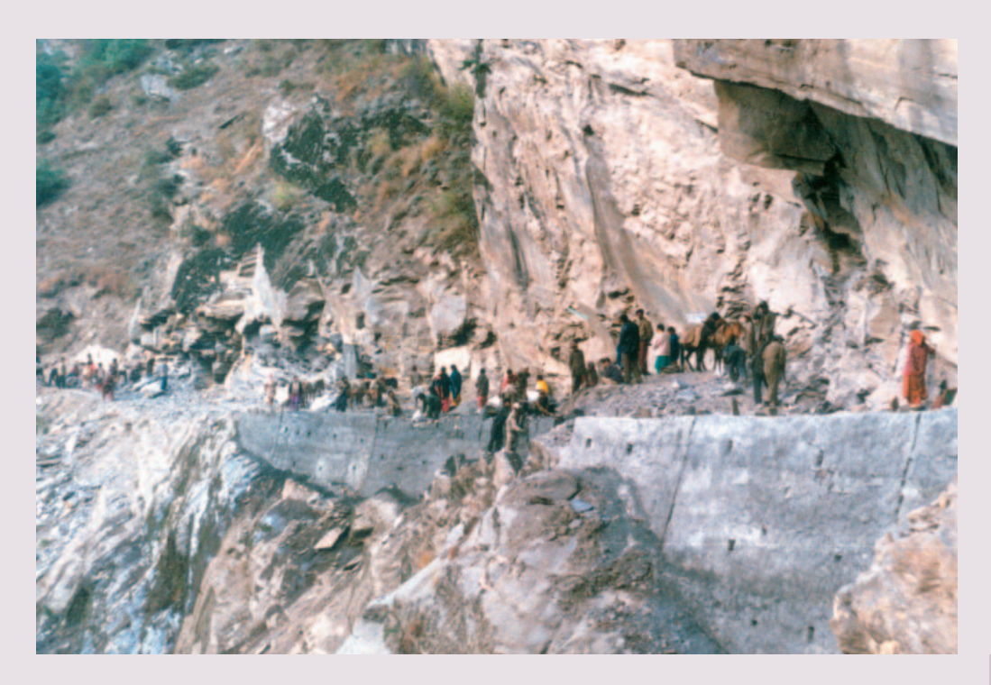
FIGURE 4 Daily wage laborers at a road construction site in Pangi Valley.

the next financial year. Major development activities did not function properly because of bureaucratic procedures, poor means of communication, and summer being the only working period. People failed to find alternatives and have continued to depend on traditional livelihoods based on limited local natural resources.