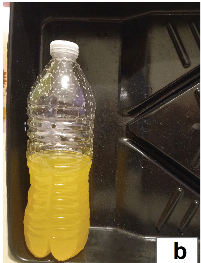
Fig. 2. Polyethylene bottles with 5 mm holes (a) baited with Cera Trap® (b).