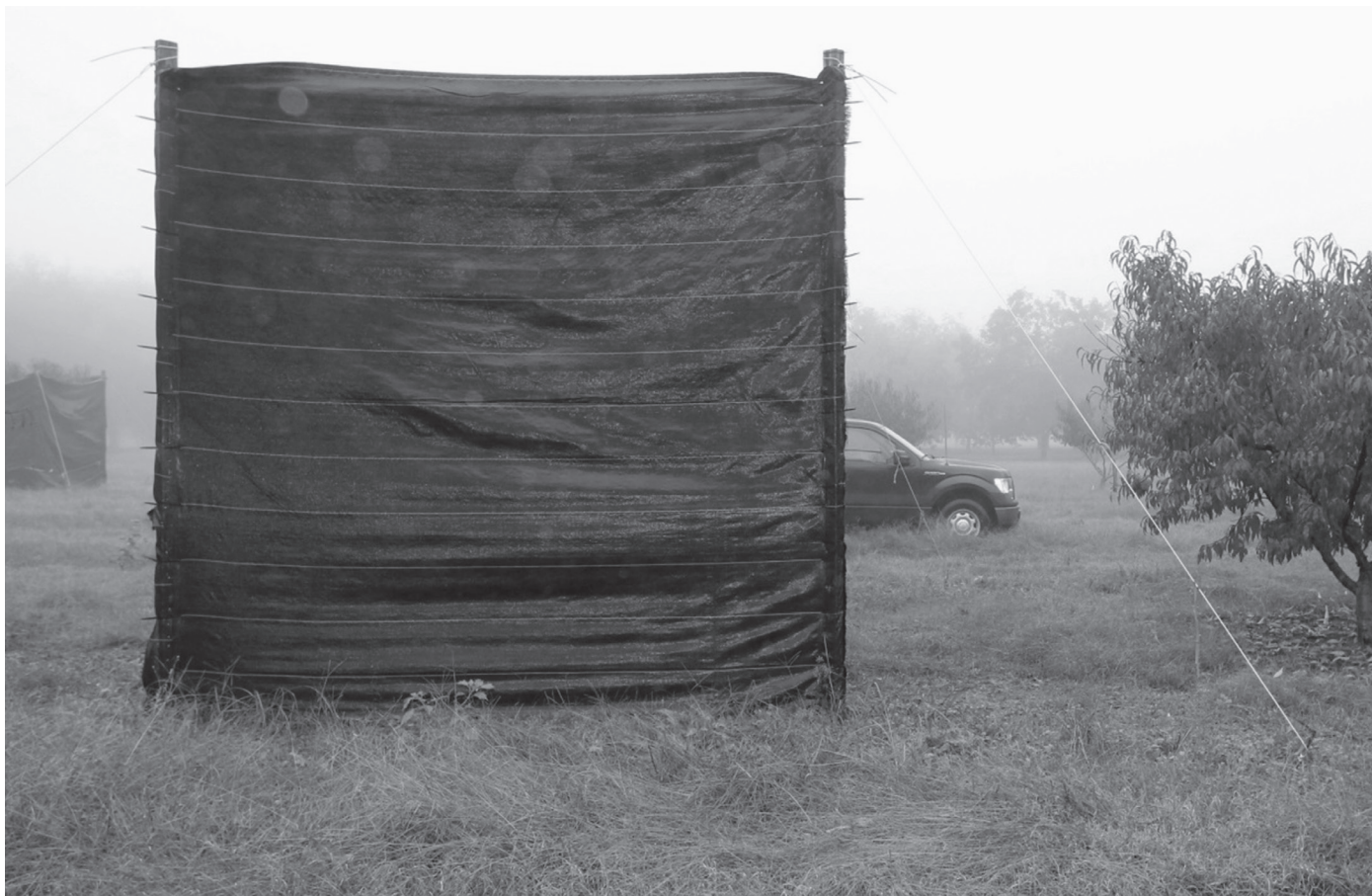
Fig. 1. A 3.7 × 3.7 × 3.7 m fence was erected around a peach tree to determine if this physical barrier would reduce adult Euschistus servus from reaching a pheromone-baited trap placed inside the enclosure near the tree.