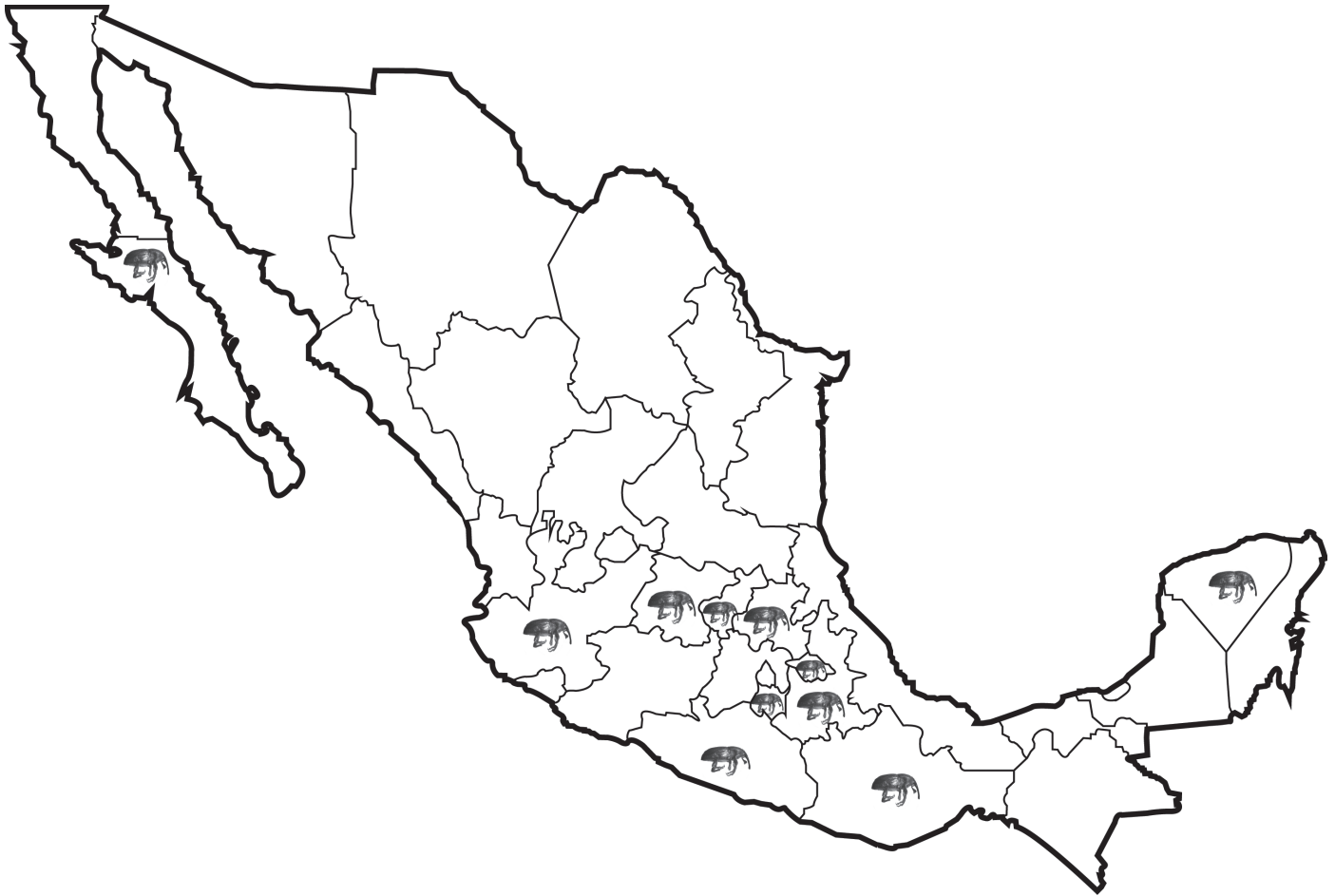
Fig. 1. Distribution of Scyphophorus acupunctatus in Mexico.