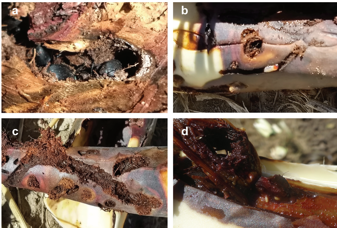
Fig. 2. Infestation of Agave salmiana by Scyphophorus acupunctatus : (a) damage by adults in the beam, (b, c) channels built by larvae, and (d) agave heart rot.

attack during any mo of the yr, although attack is more frequent in the rainy season (Terán-Vargas & Azuara-Domínguez 2013). However, activity varies among different species and geographic location. For example, the highest activity occurs on A. tequilana during the mo of Feb to Jul (Solís-Aguilar et al. 2001). On Agave angustifolia Haw., in the Oaxaca central valleys, maximum activity has been observed in the mo of Jun to Oct, which represents the wettest and warmest period of the year (Aquino-Bolaños et al. 2007). Figueroa-Castro (2009) found the largest populations of agave weevil on A. angustifolia during Apr, May, and Jun in Ahualulco and Amatitán (Oaxaca State).